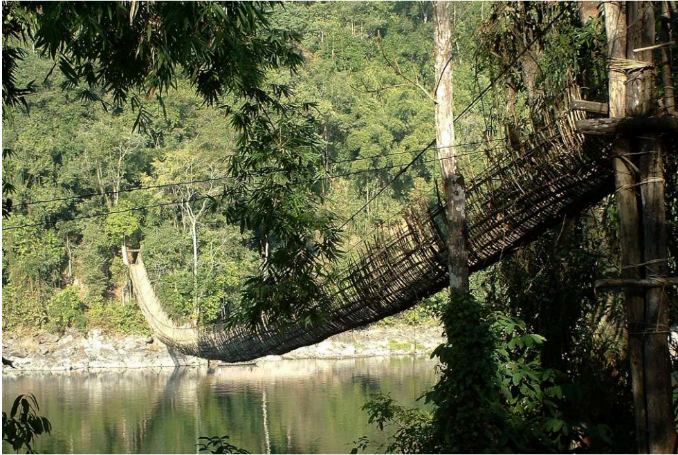
Fig 7: Suspension bridge over the Siyom River

The Siyom is one of the right bank tributaries of the Brahmaputra, called Siang in Arunachal. The bridge is about 200-m long, the deck is made of rattan and bamboo and the masts at both ends of wood. The people of Kabu as well as most of the settlements on either side of the Siyom River call themselves Galo and belong to the large Adi linguistic and cultural group. Traditionally, Adi village communities had sovereign rights over the paths and bridges crossing their territory and were responsible for their maintenance. Suspension bridges of this type were for a long time the only way to cross the tributaries of the Siang. The Siang itself was crossed by long rafts that were pushed off from the riverbank. The water spirits, the Nipong, made river crossings particularly fearsome, for they tried to grab hold of intruders. Travel between villages, and more generally circulation on the southern slopes of the eastern Himalayas, was facilitated by an extensive network of structures which, in addition to bridges and rafts, included ladders for steep passages or slabs to cross marshy terrain. In this part of the Himalayas, the circulation of goods between Tibet and the Indo-Gangetic plain was less a matter of long-distance caravans than of nearby exchanges, almost from village to village: animal hides and chillies were bartered for rock salt, woollen articles, Tibetan crockery... Certain metal items from Tibet, such as cauldrons, swords or bells, could be used as money.