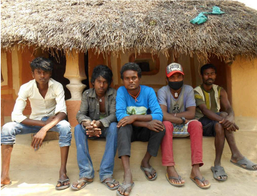
Fig 19: Stuck in Sunsari

Labour migration is not for everyone! Access to paid work abroad depends on a person's socio-economic status. This is especially true for people who belong to Dalit groups in the Tarai plain. These young men from the Musahar (also known as Rishidev) community, who belong to one of the most exploited and poorest communities in Nepal, live on government-owned land and have no land of their own. In the hamlet where they live, which is made up of about 50 houses, only a few men have managed to get work in the Persian Gulf or in Southeast Asia, India being the main nearby destination but offering low pay. Others, like those in the photograph, hope to go to Qatar or Malaysia one day but, because they have no land to mortgage, local moneylenders and banks are unwilling to lend them the capital they need. Moreover, they are afraid 'that financial investment company brokers will double-cross them', which happened to one of their neighbours. So, in order to ensure their family's livelihood, they work as daily wage workers on village farms. They feel trapped in the village, not knowing how to assume their future position as head of the family in charge of the household.