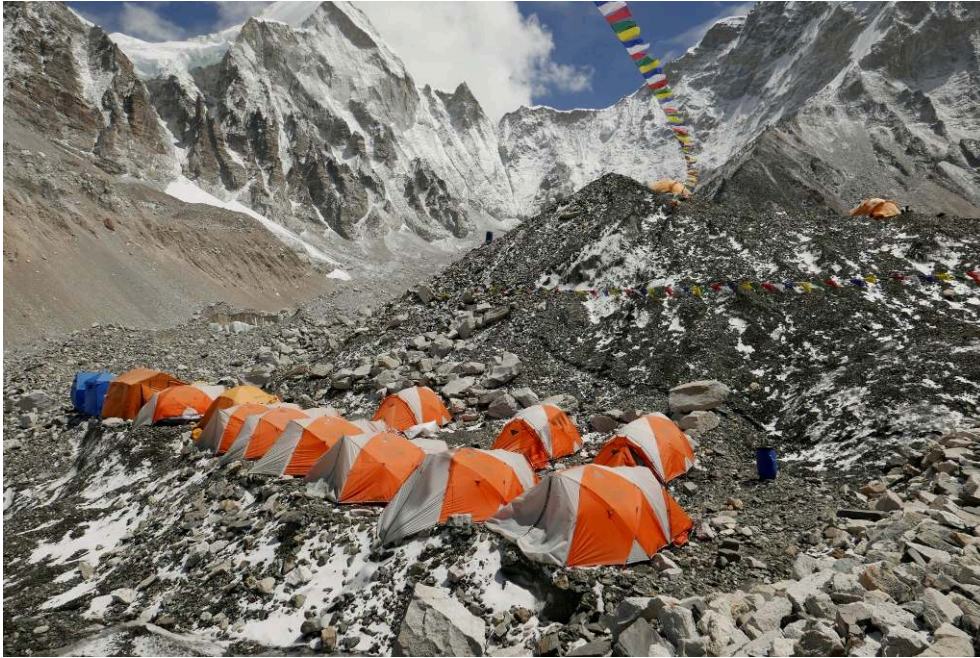
Fig 9: Mushrooming tents at the foot of Mount Everest