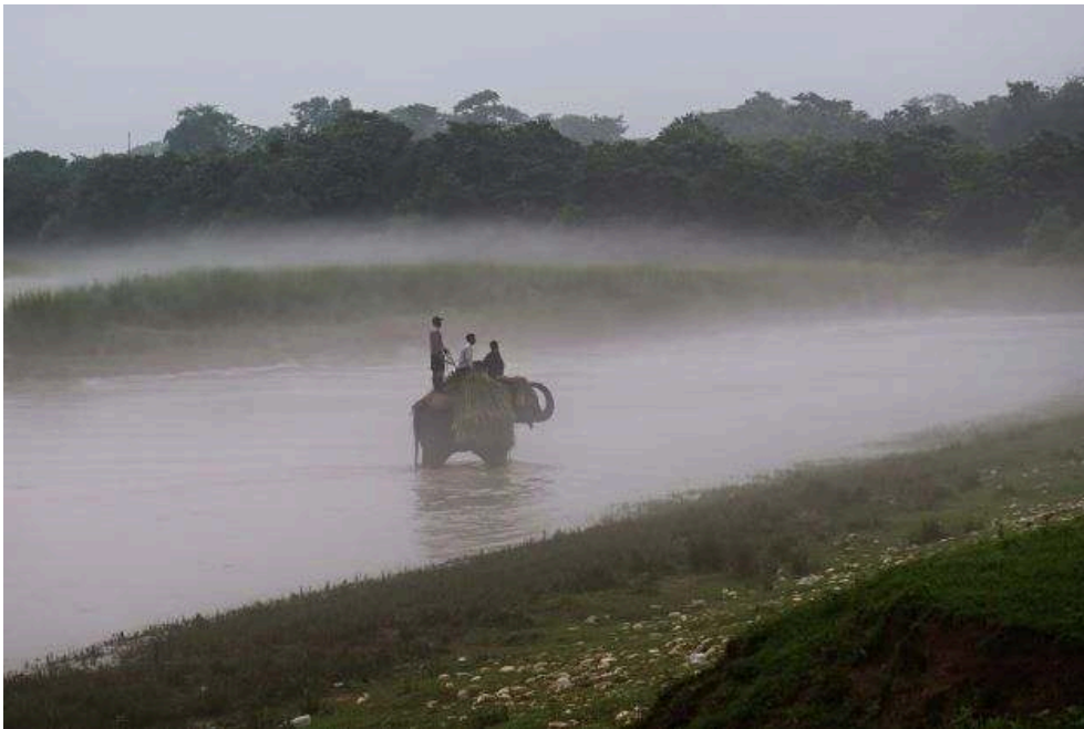
Fig 8: Elephants as go-betweens