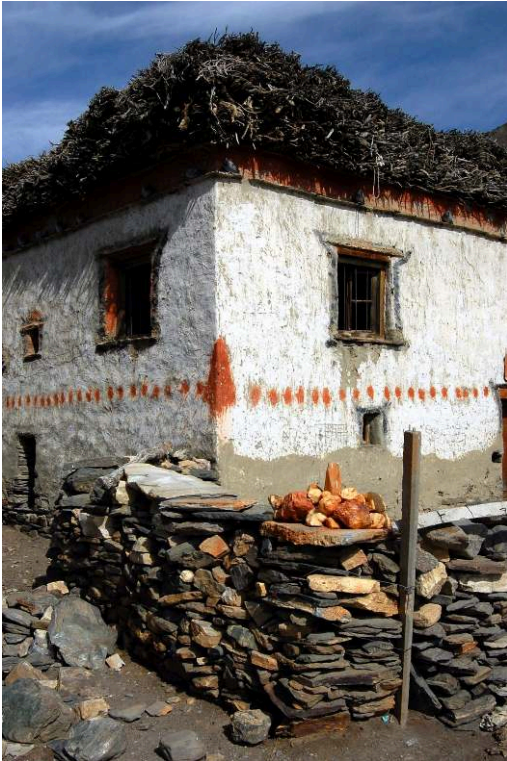
Fig 12: Ghost roads in Ladakh

In Ladakh, Buddhist houses are typically distinguished by red markings or stones used to divert the harmful tсен or tsan spirits (Tibetan btsan ). These markings – made with red ochre called tsak (T btsag ) or with pointed red stones known as tsendo (T btsan rdo ) – are meant to act as waymarkers for the tсен , diverting them around and away from human houses; for at night tсен wander along their own roads, tсен lam (T btsan lam ), spreading illness and misfortune wherever they linger. To meet one after dark poses great danger, especially if you see a tсен from behind – for where its back should be there is only a gaping hole that causes madness or death to the viewer. If you meet a stranger on the road at night, as customary advice has it, you should always look straight on and never turn back. The presence of tsak markings or a tsendo is meant to indicate the potential presence of one of these roads, which are normally invisible to people and can only be discovered through divination or consultation with a spirit medium. Yet almost every Buddhist house is marked with tsak or tsendo , and the roads of the tсен seem to correspond exactly to human roads and paths that pass through villages. Any stranger met at night may be a tсен ; the dangers of human movement blur indistinguishably into the threat of spirits and, by night, ordinary paths and familiar places take on a hostile aspect.