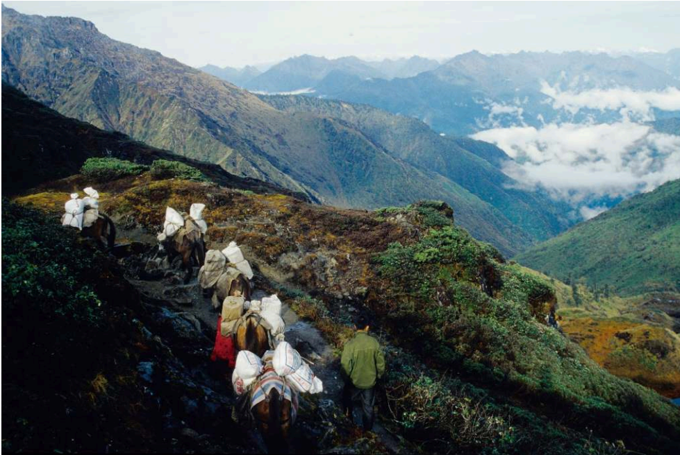
Fig 3: The last caravan

The Dulong River Valley, in the north-western corner of Yunnan province bordering Myanmar, has long been very remote and difficult to access. Following its incorporation into the People's Republic of China in the early 1950s, the existing mountain trail was improved to allow mules to transport food and equipment to the valley's inhabitants, the Drung (Dulong), one of the smallest minorities in China. This communication route became the main artery linking Drung communities to the outside world. The state-subsidised caravan, 500 mules strong at its peak in the 1980s, was responsible for transporting most of the consumer goods and various reliefs that the government provided to these disadvantaged and destitute slash-and-burn farmers, in order to promote economic development. Each summer the caravan, leaving from Gongshan on the banks of the Salween River, crossed the Gaoligong Mountains, a three-day journey over the pass at an altitude of 3,800 m. With the first snow, the valley was once again isolated for six months. The year 1999 marked the end of what had become the last state-sponsored caravan in China with the opening of a 96-km motorable road. The Drung were the only minority in China whose main settlement area had not yet been connected by road. Since then, a seven-kilometre tunnel through the mountains ensures access to the Drung valley in all seasons, reducing the distance from Gongshan to Kongdang, in the centre of the valley, to 76 kilometres.