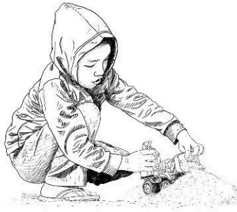
Fig 15: Dozer imaginations