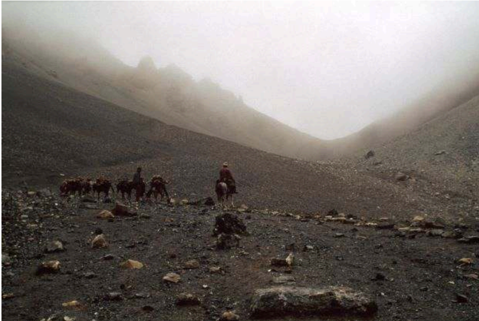
Fig 4: A trader heading to Purang in Tibet