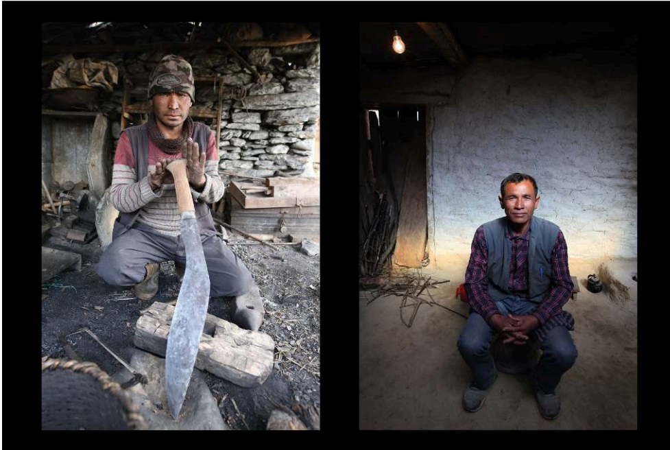
Fig 18: Migration: trends and exceptions

In these two men's home village – a Himalayan village in western Nepal – outmigration is the norm. Almost every household has at least one member abroad or a returnee.