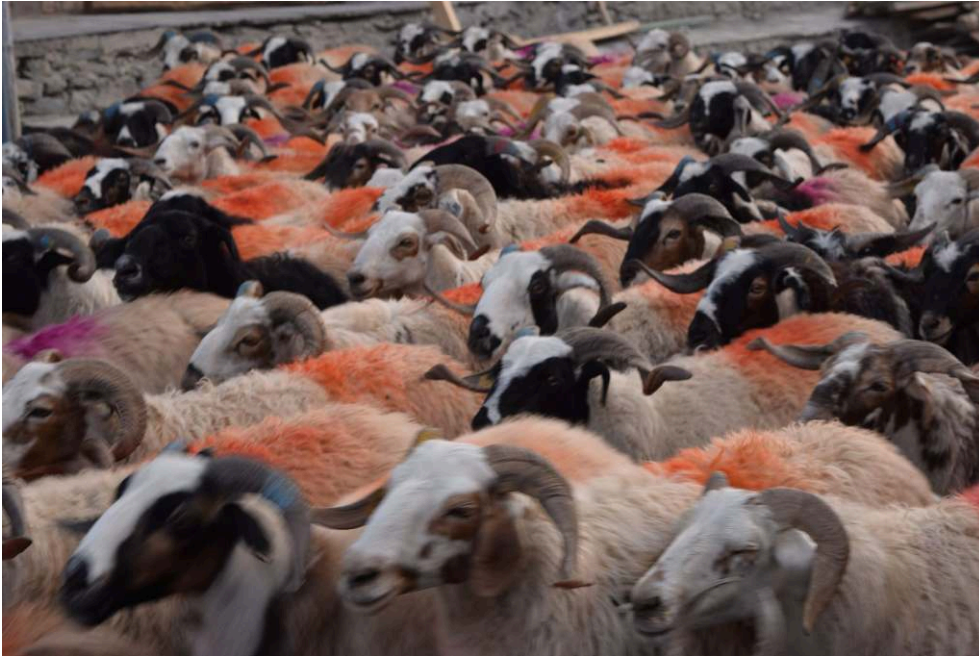
Fig 5: Mountain goats on the road to Pokhara

Mustangis, mostly the Lobas (people of upper Mustang), bring down Himalayan goats to Pokhara at the start of winter. These goats are regarded as ritually pure and essential for the sacrifices performed during the 8th and 9th days of the Dashain festival. It is believed that Himalayan goats are nutritionally superior as they feed on jaributi (herbs) that grow at high altitude in the Himalayan region, and therefore eating their meat provides good immunity against diseases that may affect people during the winter. The seasonal movement of animals relies on mutual agreements between herders, generally the owners of the herd, and the local communities along the trail. Designated households let the animals graze in their fields to fertilise the earth with manure and, in exchange, herders are given food and food grain. These agreements coexisted with other forms of exchange and social relations. Herders would bring jaributi and other high-mountain products, such as jimbu ( Allium hypsistum ), silajit (bitumen) and woollen mats, which were exchanged for food grain. These traditional practices, which are still common, would therefore ensure people's and animals' safety and security and improve livelihoods in different ecologies, creating a kind of symbiosis. In recent times, traders from the lower hills have also travelled to Mustang to purchase at a cheap rate goat herds which they now often bring down by truck because a motorable road has been built between Pokhara and Mustang.