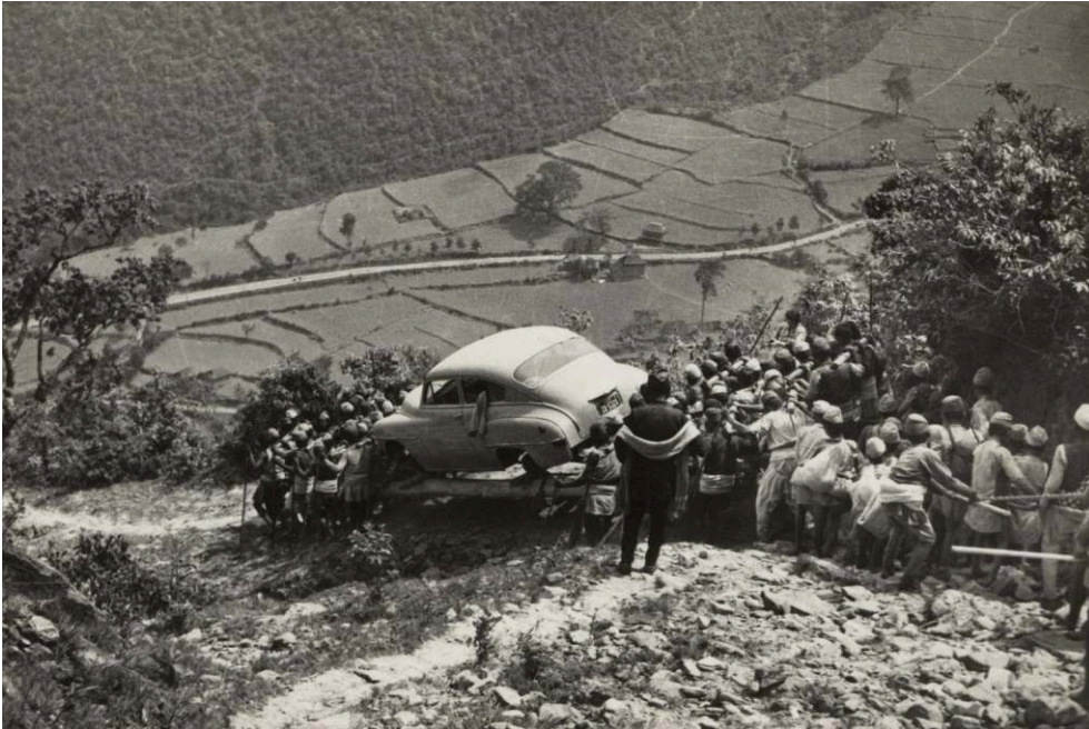
Fig 1: A country where people carry cars