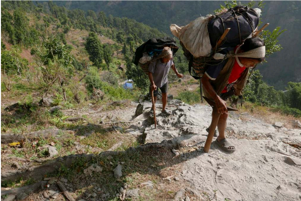
Fig 2: On the paths of the 'pure' and the 'impure'

In Khumbu, the region around Mount Everest and Sagarmatha National Park, the slaughter of animals is no longer tolerated. In this region where the majority of the population is Sherpa, the notion of beyul – a sacred place where Buddhists would be protected in times of trouble and where one must refrain from killing any living thing – was introduced by monks from Nyingma monasteries when they arrived here in the early 20th century. This concept was taken up by the National Park administration when, in the 1990s, local culture and religion were used to ensure better nature protection. Thus, the Park offers tourists an immersion in a Buddhist land of great spirituality, where the idea of a 'pristine nature', almost untouched, protected by the Sherpa population, is reinforced by the notion of beyul . That is why, in this region where 'purity' dominates, the presence of the slaughterhouse has become unacceptable. Initially built in Namche Bazar, at the heart of the Khumbu where it remained until 1998, the slaughterhouse was moved more than 20 km southwards to be relegated to Rai and Tamang country. Once the animals have been slaughtered, the Rai and Tamang transport the meat northwards, as in this photograph, to Sherpa country where it is eaten by tourists and... by the Sherpa themselves.