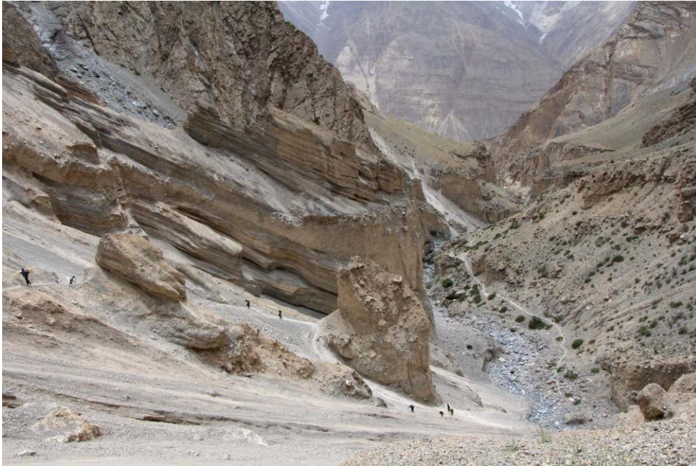
Fig 11: The ways of the gift

A group of men, laden with beams, sets off for the Zardgarben pastures, which culminate at an altitude of 4,050 m, to build a refuge in honour of a respected elder, Khayal Baig. The hut will house Pakistani and international sportsmen, including footballers, eager to test their physical ability in high-altitude conditions. As with other local infrastructures, this construction is being built by the people of Shimshal thanks to a donation system called nomus : one family provides the material and financial resources for all the other families who, in turn, are responsible for mobilising their labour force to build a structure named after a person the donor family cherishes dearly. Indeed, in the Shimshal Valley, since at least the beginning of the 20th century, refuges, irrigation canals, bridges, paths and roads are all collective achievements through which locals can address wishes and prayers to eponymous persons. The inhabitants take part in these constructions out of personal and family interest, out of a moral obligation to the community, because of their attachment to the deceased and out of concern to please God and save their souls. Indeed, for these Ismaili Muslims, actions carried out in the name of the Ismaili community nourish the soul, the invisible part of the being. By contributing to building projects for the community, they take God as witness and progress along the spiritual path.