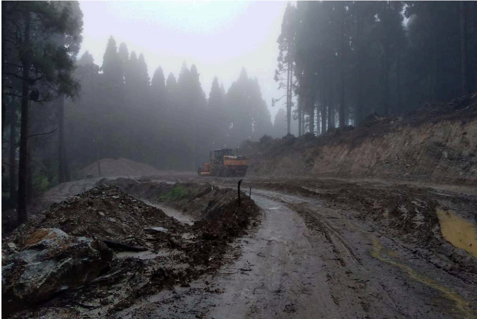
Fig 13: Road in the mist

The photograph visually captures the construction process of the 200-km long (120-mi-long) National Highway 717A that traverses the rich, lush vegetation cover of the Labha and Kaffer region in Kalimpong, West Bengal. There has been a massive clearing of forests along this stretch and work progress is being challenged by the bad weather during the rainy season in the hills. The photograph captures how construction work on the road is fraught with danger when the region is covered in mist, with recurrent problems due to landfall, leeches, etc. Navigating through the misty alpine forests, the road assumes a mystical form both in appearance and by echoing popular narratives as it promises a new avenue of mobility for Kalimpong and Sikkim, thus traversing the dangers of the already derelict National Highway 10. This new road project is part of the Bharatmala Pariyojna funded by the Government of India's Ministry of Road Transport and Highways. This road starts at Bagrakote in West Bengal and ends in Gangtok. In the State of West Bengal, the road passes through Bagrakote-Labha, Algarah and Pedong, crossing into the State of Sikkim at the Reshi border, and then continues to Rhenock, Rorathang, Pakyong and Ranipool to reach Gangtok.