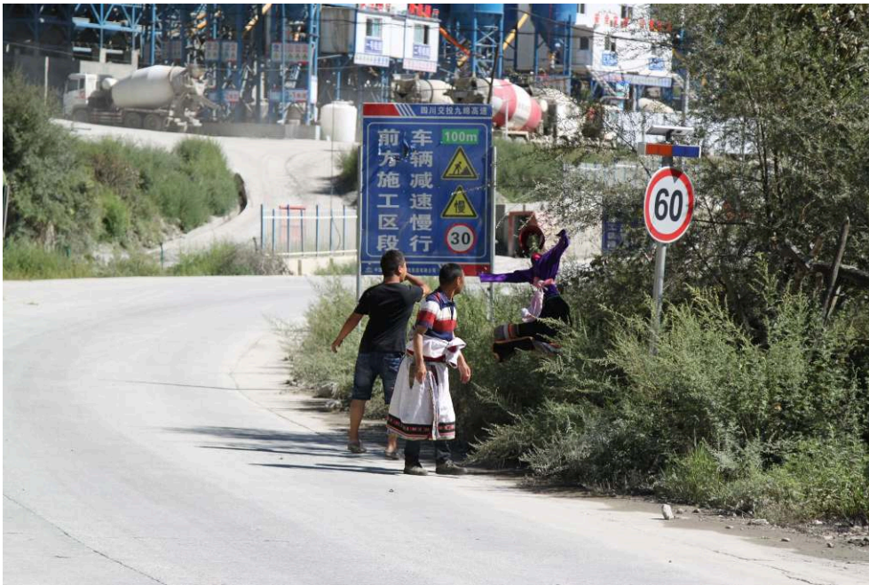
Fig 17: Ghosts on the Jiu-Mian Highway