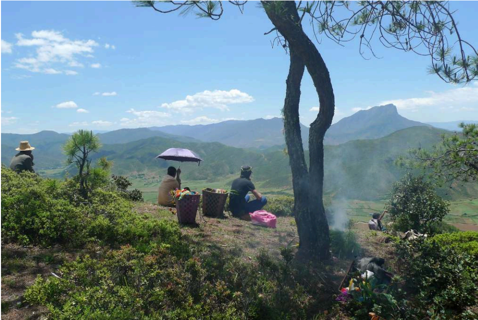
Fig 10: 'Circling the mountain' ( wujiu ) among Wenquan Pumi

On wani , the fifth day of the fifth month in the local traditional calendar, Pumi (Premi, Tronmu) villagers in the Wenquan area make a customary hike along the mountain ridge above their settlement to burn incense ( sondon ) for mountain deities and to pray for plenty of rainfall to ensure a good harvest. A series of shrines ( sondondon ), in the form of small stone heaps under a pine tree or finely constructed cairns of various sizes, are located along the mountain ridge. At each shrine, in addition to burning incense with pine needles, cypress leaves, grain flour and self-brewed alcohol, villagers also bring calamus – seasonal wani flowers – and wild rhododendron flowers as offerings and as decorations for shrines. In the trees surrounding a shrine, people hang five-coloured flags printed with the mantra 'Om mani padme hum' in Tibetan script as decorations and to spread the mantra's blessing through the wind. Tired from a steep hike before reaching this shrine, we sat down for a rest after giving the offerings and enjoyed the splendid view from the hilltop. Two regional mountain deities are visible. The highest is the Lioness Gemu of Yongning (Hlidi Guemu or Talong singen Guemu). Further away and east of Gemu is Punan of Wujiao (Wejiu Punan). Circling the mountain used to be a ritual involving the entire local community. However, in recent years, fewer and fewer villagers have come to visit the mountain shrines on wani .