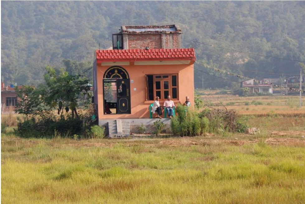
Fig 20: 'Khane, basne': eating and sitting

For more than four decades, mountain farmers migrated to the plains of Nepal to cultivate land. The 2000s marked a turning point: these settlements in the Himalayan foothills are now mainly to be found in peri-urban areas where land is so expensive that only a small plot of land can be bought to build a house. The number of houses on the outskirts of villages and roads is multiplying, gradually taking over agricultural and rice-growing areas. Among the new settlers, these men in the picture, sitting comfortably on the terrace, explained that they came to the plains to ' khane, basne ', 'eat and sit', in contrast to the harshness of life back in the mountains or during labour migrations. Indeed, the particularity of these settlements is that they are now established once a sufficient amount of money has been accumulated during labour migrations abroad (mainly to the United Arab Emirates). Thus, in addition to the north-south movement characteristic of the now long-standing mountain-plain migrations, there is an initial move to distant foreign countries (via labour migration) in view of settling in the plains later on. Newcomers are no longer dependent on agriculture or other manual work, and their migrating here (geographic mobility) goes hand in hand with socio-economic mobility because they expect to find an activity in the secondary or tertiary sector to allow them to eat while sitting comfortably.