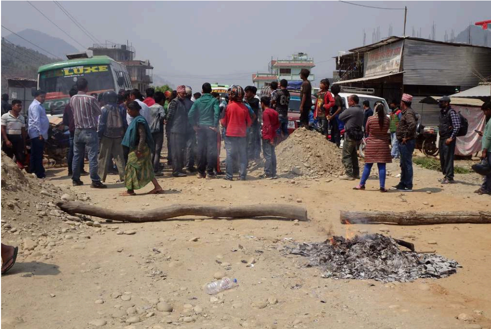
Fig 16: Halting movement

Scene of neighbourhood protest against traffic behaviour, on an unmetalled informal road along the Likhu Khola Valley, running between Shivapuri and Bidur, Nuwakot District. In recent years, several bus companies travelling to Trisuli Bazaar had begun using this route to avoid the delays caused by congestion at the Thankot exit from the Kathmandu Valley. Following the ten years of civil war (1996–2006), road blockades had become quite a frequent practice in the period of the post-conflict struggles in Nepal, with the halting of movement being a very effective means to bring attention to political issues, often not connected to roads as such. In this case, the local population and businesses located along this road were concerned with the increase in traffic and reckless driving, worried that risks of accidents were not adequately considered. Roads can become sites of protest, and bandas (closures) of roads are common in South Asia, where halting the circulation of goods and people has become a regular way of making demands.