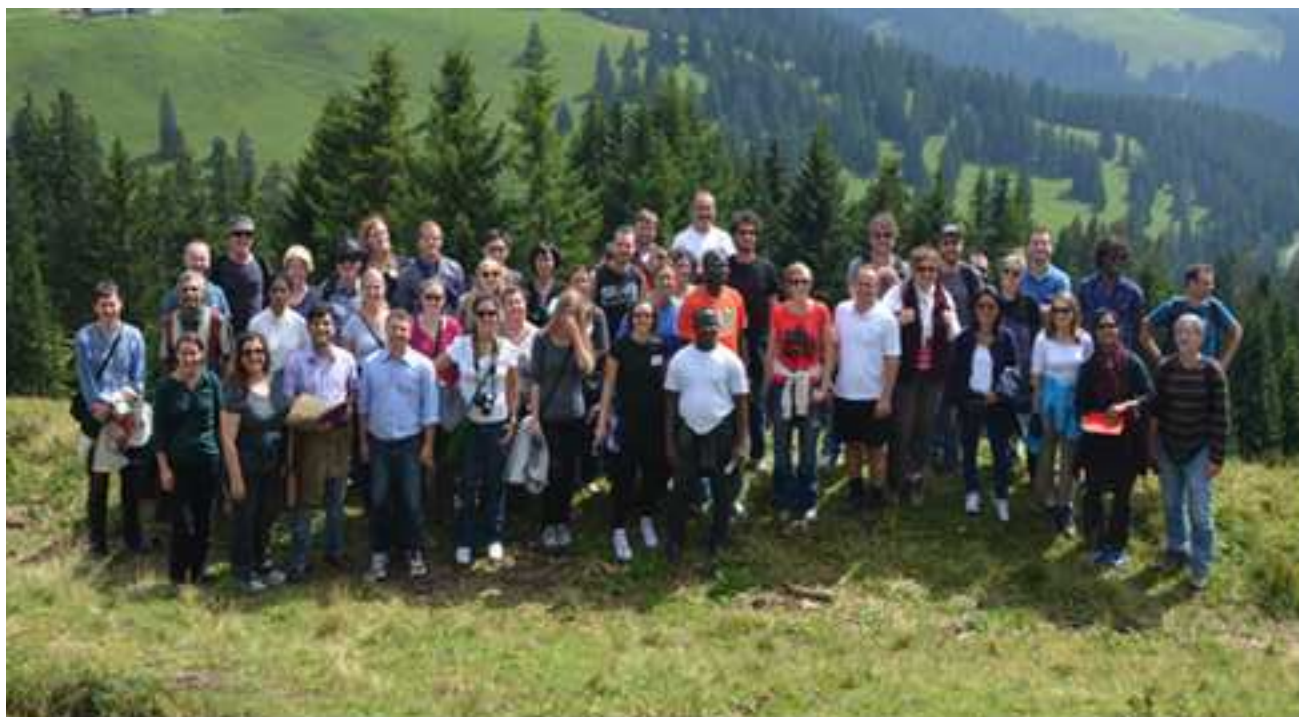
Figure 1 Click here to download high resolution image