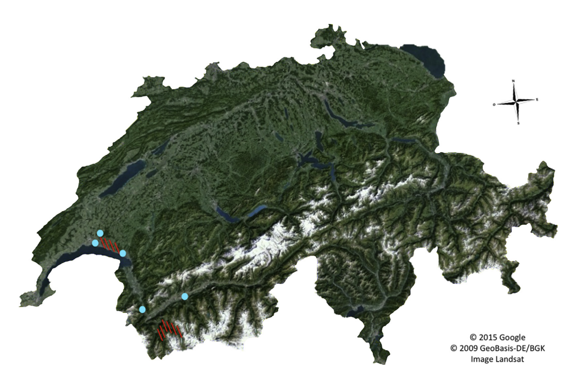
FIG. 2. Absence of positive tick samples for presence of Coxiella burnetii DNA in Switzerland. All 8534 pools were negative for presence of C. burnetii DNA, even in collection sites (blue dots) located near area where two Swiss Q fever outbreaks occurred (red lines).

keep monitoring for the presence of this pathogen in ticks and in wild and farm animals.