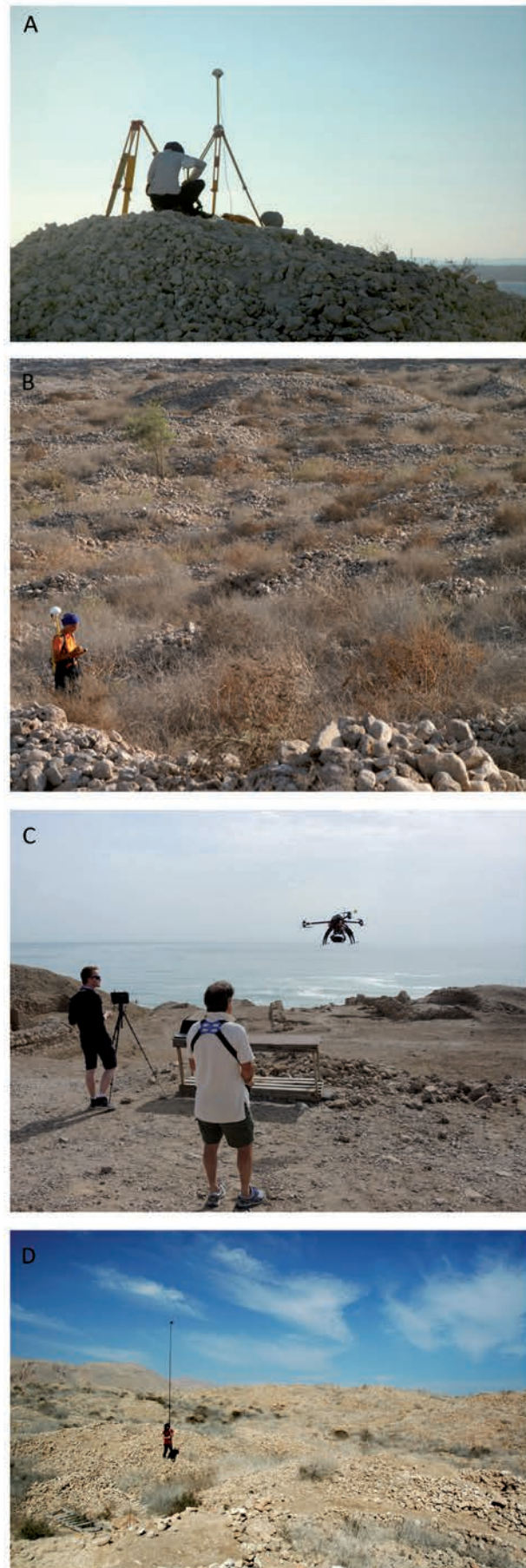
Figure 1.4. The Cartographic Project: A-B) Differential GPS survey (CNRS-Archéorient); C-D) Drone and pole photogrammetry (Iconem).

The archaeological material unearthed during excavations has been recorded in dedicated databases and studied by specialists; apart from the