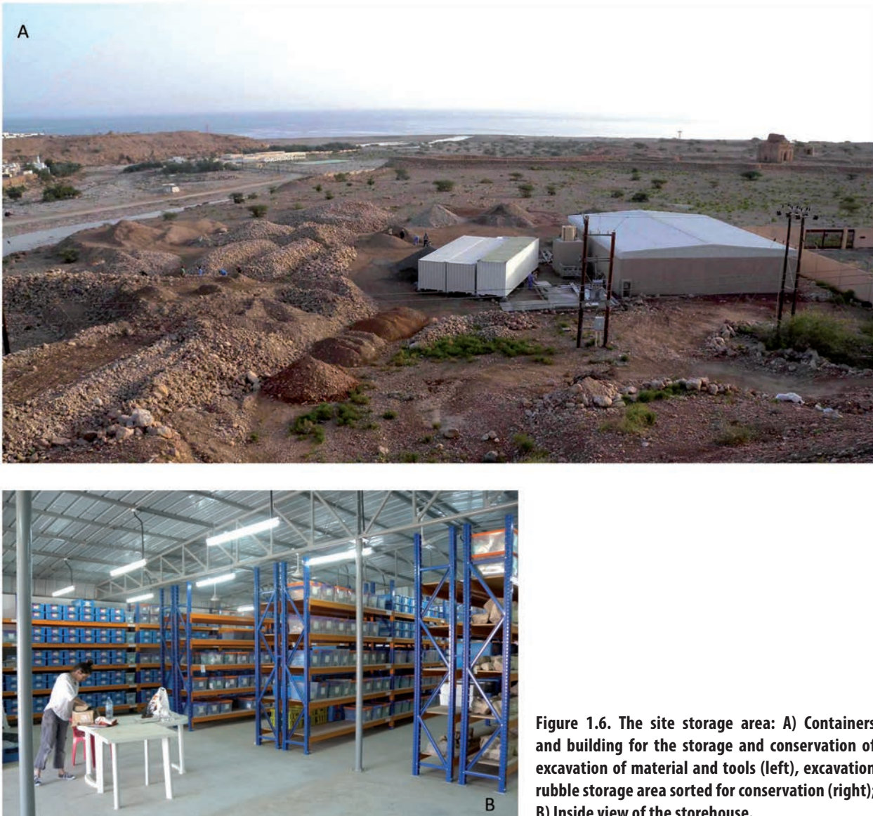
Figure 1.6. The site storage area: A) Containers and building for the storage and conservation of excavation of material and tools (left), excavation rubble storage area sorted for conservation (right); B) Inside view of the storehouse.

was quite badly known but the discovery and extensive excavation of a pottery workshop of the 14 th century (Chapter 10) was of a great help to the study of the local ceramic production and trade (Lesguer and Renel 2018). Physico-chemical analyses of sherds were also carried out 3 to help identify the characteristics of this local production (Rougeulle et al. 2014; Gianni et al. 2020). A preliminary study of the Far Eastern imports was carried out in 2011 by B. Zhao (CNRS-CRCAO, Centre de recherche sur les civilisations de l'Asie orientale), and analyses were also held to search for the exact origin of this material (Simsek et al. 2014; Zhao et al. 2017).