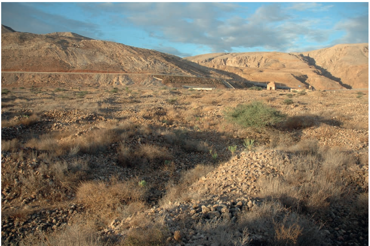
Figure 1.1. The ruins of Qalhat from the east with the Bibi Maryam mausoleum in the background.

The first modern description of the ruined city of Qalhat is by the British J.R. Wellsted, a member of the Bombay Marine, who achieved in the fall of 1835 an extended journey through Oman. From Muscat he sailed to Sur but had to anchor for a few hours off Qalhat ( Kilhât ) due to strong winds, and he took the opportunity to land at the site. He noted the great extension of the ruins where only ‘a small mosque’ remains ‘in a state of tolerable preservation’. Fortunately, he had time to walk to this building, in fact the mausoleum of Bibi Maryam (Figure 1.1), of which he gives an interesting description (Wellsted 1838, I: 41-42; see below, Chapter 7). Wellsted also mentions that the inhabitants of the present village north of the site used to search the ruins for gold coins, some of them bearing ‘the name of the Caliph Haroun Al-Rashid’. This assertion seems rather false because, first the site does not seem to have ever been looted; second, no coins other than copper or lead have been found at the site since excavation began; and third, and most importantly, the founding of Qalhat is at least three centuries later than the reign of Haroun Al-Rashid (below, Chapter 2).