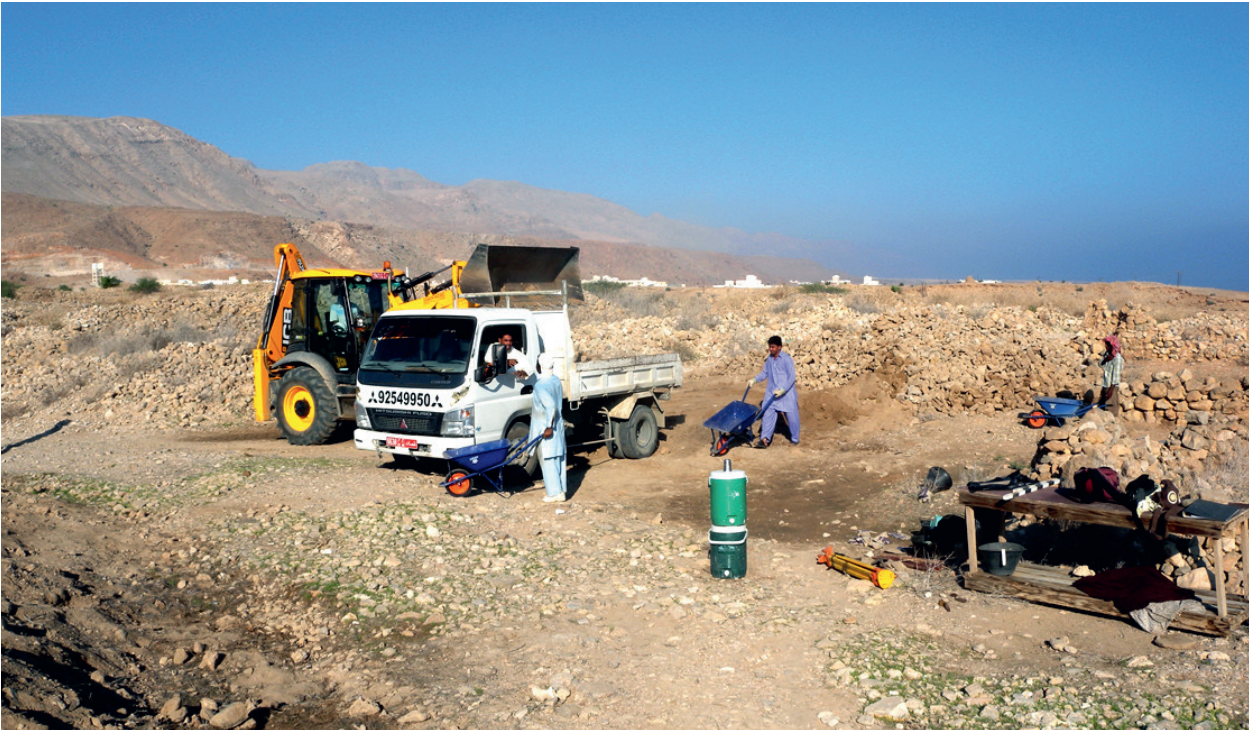
Figure 1.3. Evacuation of rubble from the excavations of building B21.