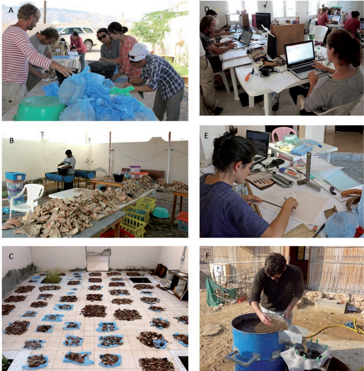
Figure 1.7. Material registration and studies: A-C) Sorting, washing and drying of excavated material after fieldwork; D) Field data recording; E) Ceramic study; F) Flotation for micro-fauna and botanical sampling.

Finally, a rather extensive historical study was carried out on historical sources to complete that published by Bhacker and Bhacker (2004) and to help understand the topography and evolution of the town (Rougeulle 2017; see Chapter 2).