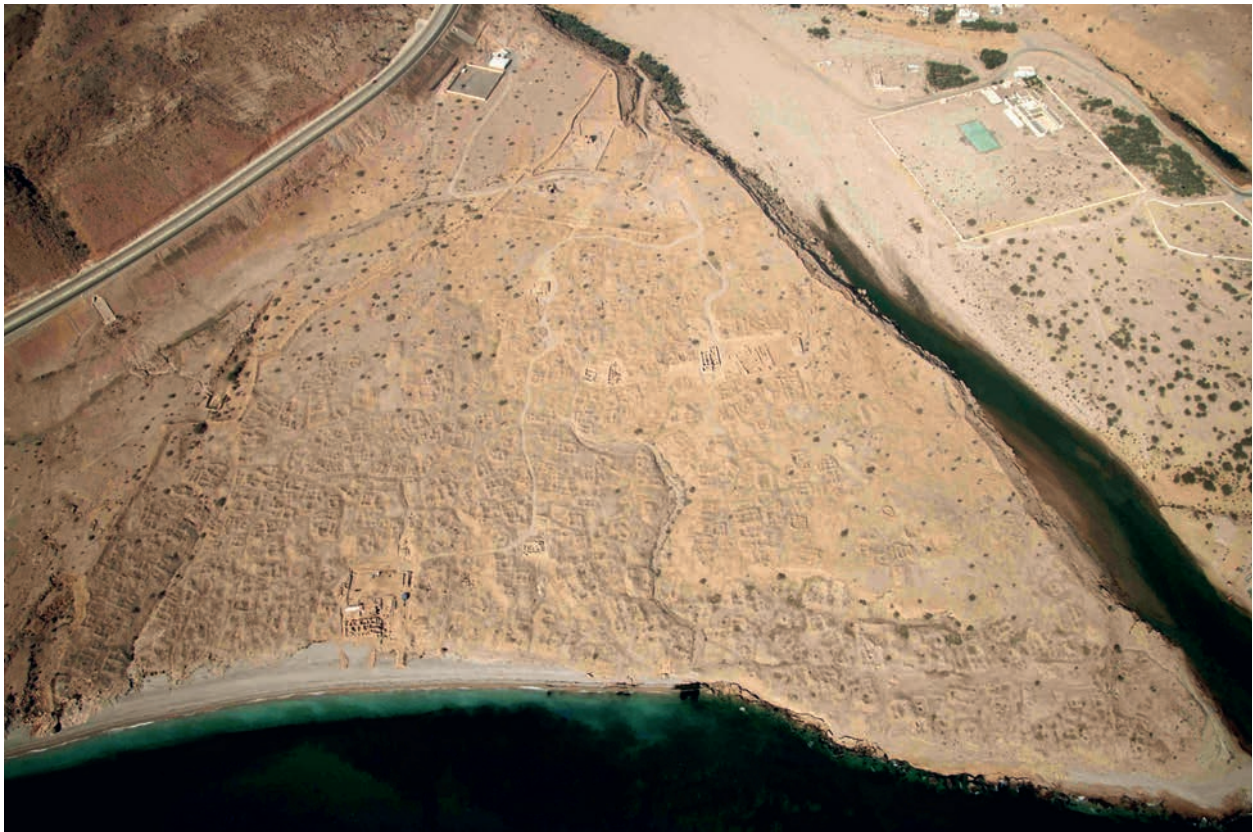
Figure 1.2. Aerial view of the site from the east (© MHT).

The site of Qalhat appears like a vast ocean of collapsed small limestone blocks, cobbles and coral, with elongated heaps of stones, like waves, in all directions; not a single clear feature appears on the surface, and only a few wall alignments are discernible (Figure 1.1). But the heaps are clues to underlying walls, as shown in the aerial views where many buildings are clearly visible and the general town planning appears (Figure 1.2).