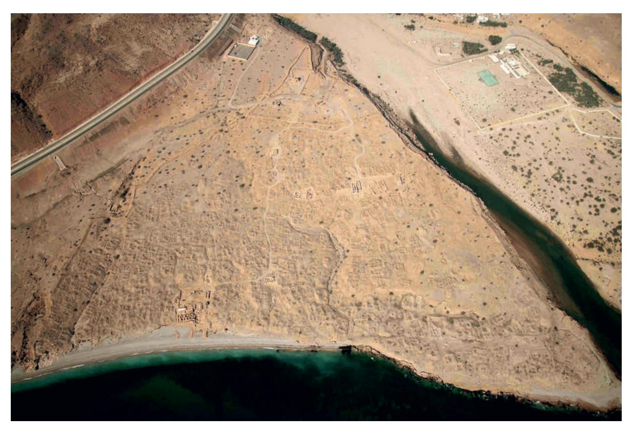
Figure 1.2. Aerial view of the site from the east.

The site of Qalhat appears like a vast ocean of collapsed small limestone blocks, cobbles and coral, with elongated heaps of stones, like waves, in all directions; not a single clear feature appears on the surface, and only a few wall alignments are discernible (Figure 1.1). But the heaps are clues to underlying walls, as shown in the aerial views where many buildings are clearly visible and the general town planning appears (Figure 1.2).