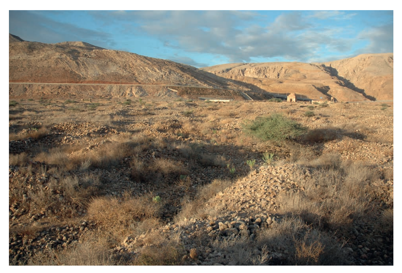
Figure 1.1. The ruins of Qalhat from the east with the Bibi Maryam mausoleum in the background.

The first modern description of the ruined city of Qalhat is by the British J.R. Wellsted, a member of the Bombay Marine, who achieved in the fall of 1835 an extended journey through Oman. From Muscat he sailed to Sur but had to anchor for a few hours off Qalhat ( Kilhât ) due to strong winds, and he took the opportunity to land at the site. He noted the great extension of the ruins where only 'a small mosque' remains 'in a state of tolerable preservation'. Fortunately, he had time to walk to this building, in fact the mausoleum of Bibi Maryam (Figure 1.1), of which he gives an interesting description (Wellsted 1838, I: 41-42; see below, Chapter 7). Wellstedt also mentions that the inhabitants of the present village north of the site used to search the ruins for gold coins, some of them bearing 'the name of the Caliph Haroun Al-Rashid'. This assertion seems rather false because, first the site does not seem to have ever been looted; second, no coins other than copper or lead have been found at the site since excavation began; and third, and most importantly, the founding of Qalhat is at least three centuries later than the reign of Haroun Al-Rashid (below, Chapter 2).