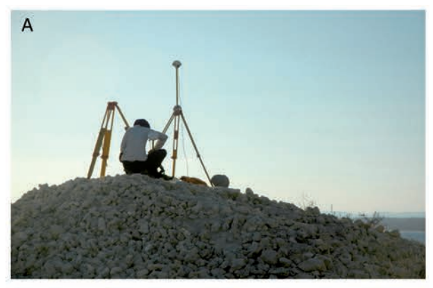
Figure 1.4. The Cartographic Project: A-B) Differential GPS survey (CNRS-Archéorient); C-D) Drone and pole photogrammetry (Iconem).

The archaeological material unearthed during excavations has been recorded in dedicated databases and studied by specialists; apart from the