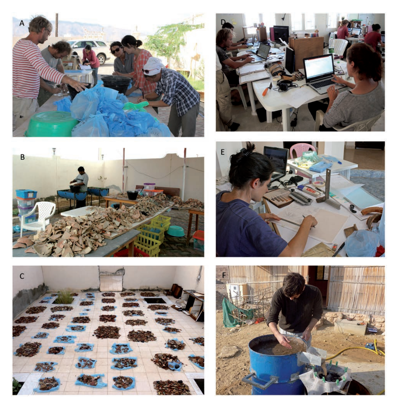
Figure 1.7. Material registration and studies: A-C) Sorting, washing and drying of excavated material after fieldwork; D) Field data recording; E) Ceramic study; F) Flotation for micro-fauna and botanical sampling.

Finally, a rather extensive historical study was carried out on historical sources to complete that published by Bhacker and Bhacker (2004) and to help understand the topography and evolution of the town (Rougeulle 2017; see Chapter 2).