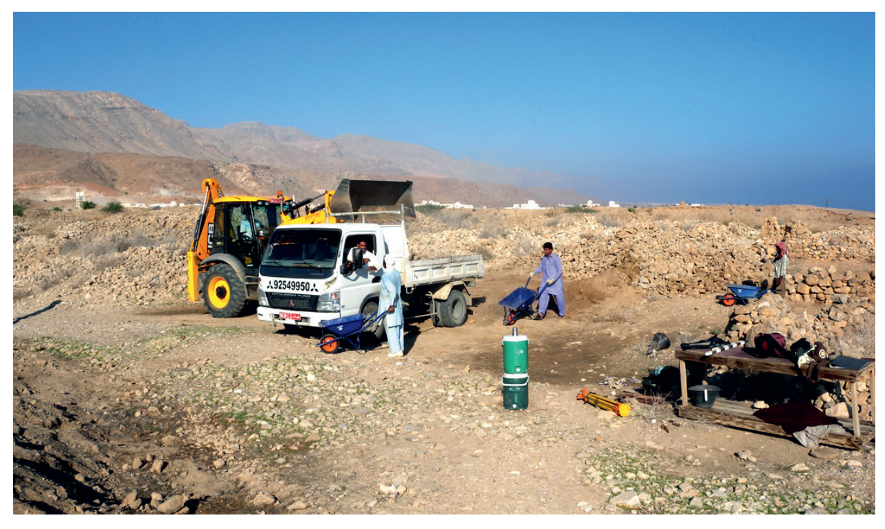
Figure 1.3. Evacuation of rubble from the excavations of building B21.