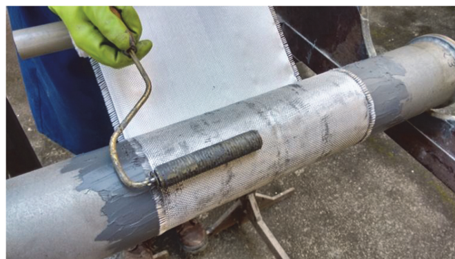
Figure 5: Pre-impregnated, bi-directional composite.