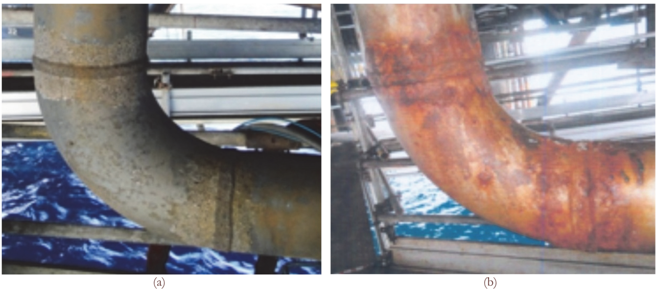
Figure 1: Super duplex steel piping assembly: (a) uncorroded welds (b) corroded welds.

Nowadays, the super duplex stainless steel pipes are increasingly used due to an excellent resistance to corrosion in harsh environments combined with good mechanical properties. However, despite the high resistance to corrosion, the welding process of this material is not simple and is susceptible to corrosion, if the welding parameters are not properly controlled [7-9]. Thus, it is possible to have duplex or super duplex steel piping assemblies with significant corrosion damage at the welds (Fig.1).