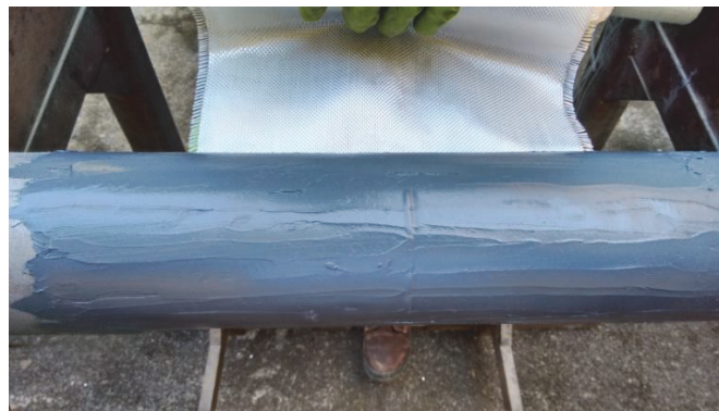
Figure 4: Primer Layer.