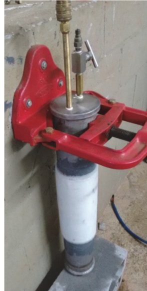
Figure 6: Hydrostatic testing.

The hydrostatic tests were performed in the bunker at room temperature condition. The specimen used in the hydrostatic test is presented in Fig.6. For the hydrostatic test, the Flutrol's Test Pac equipment was used. The pressure was increased by approximately 1 bar/second and after reaching a certain level, the pressure was maintained for 30 minutes. Then again raised by 1 bar/second up to next level, until the repair system fails. Load the tube specimen for 30 min at a particular operating pressure and then increased for next pressure level. Each test shall be monitored by a PID system to record the test results.