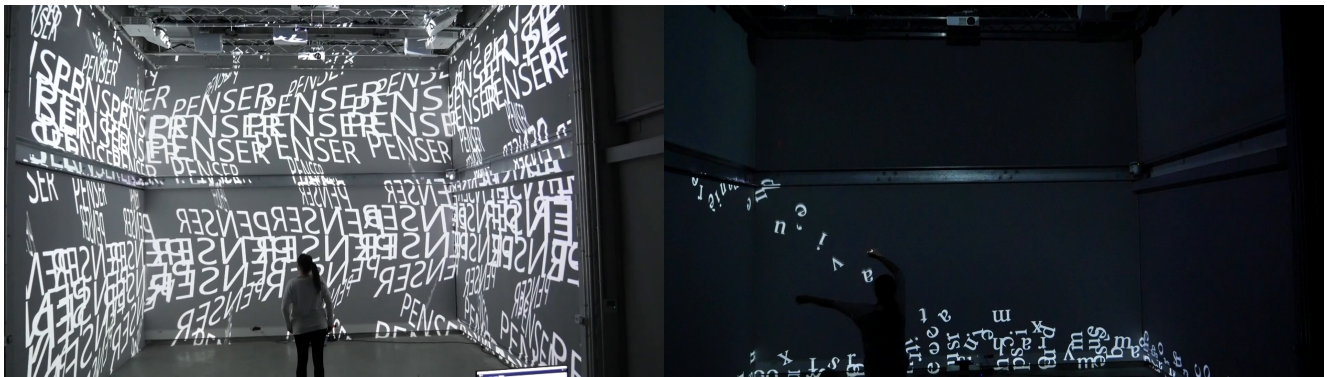
Figure 1: Preview of the proposed demonstration in use. On the right image, the "Particules" scenario illustrates how the human body movement is involved in the piece of art. On the left image, another scenario illustrates the immersive ability of the proposed installation.