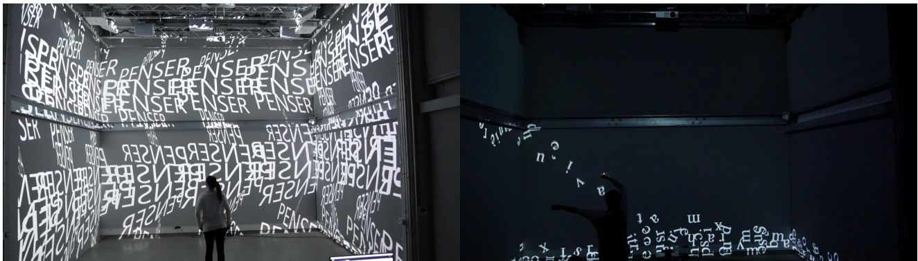
Figure 1: Preview of the proposed demonstration in use. On the right image, the "Particules" scenario illustrates how the human body movement is involved in the piece of art. On the left image, another scenario illustrates the immersive ability of the proposed installation.