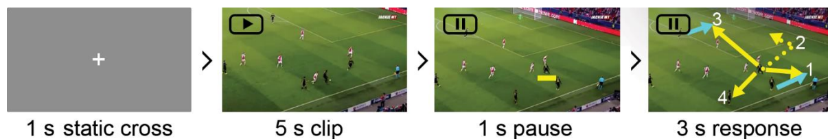
Figure 1. The order and duration of stimuli for the decision-making task.

To measure participants' decision-making abilities, we used a computer-based task, as described by Farahani, Soltani, and Rezlescu (2020). Participants watched ten short video clips of a soccer player controlling a ball. After five seconds, the video was paused, and participants were presented with four options. They had three seconds to decide on the best option in terms of building a good attacking scenario. Each decision was noted and rated by three experienced coaches who ranked players' decisions from one (worst) to four (best; Figure 1).