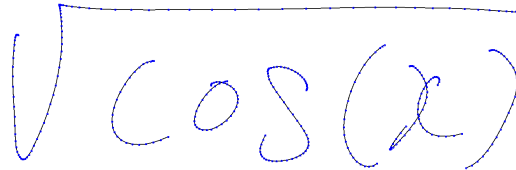
Fig. 1: On-line handwritten formula. Strokes are sequence of points (in Inkml file format).

All three tasks involved in the above system are ranked according to the rate of completely correct recognition, but each task is ranked separately.