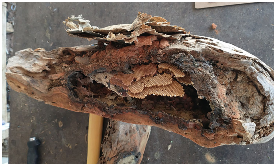
Figure 4. Nest of Plebeia flavocincta in the trunk of Commiphora leptophloeos with emphasis on the combs in the shape of horizontal disks.

chamber. The pots near the brood area were pollen pots. The shape of the food pots was oval (Figure 6). Pollen and honey pots are similar. The outer walls of the pots were thick and