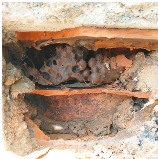
Figure 6. Compact mass of food pots from a nest of Plebeia flavocincta located in a wall.

In this study, we increased the available morphological description information from specimens of P. flavocincta collected along with its geographic range. With this new information, it was possible to delimit the species more precisely. Thus, even collected in a variety of environments, all specimens corresponded to the same taxon under study. We proposed to