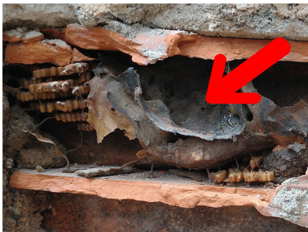
Figure 3. Brood area of the Plebeia flavocincta , with detail showing a nest entrance chamber, which was built into a wall.

Food pots are usually located deeper in the nest. They form a solid mass, but in some cases, they are spread around the brood