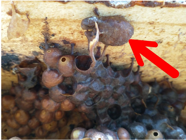
Figure 7. A special wax chamber where it was possible to find a trapped queen.