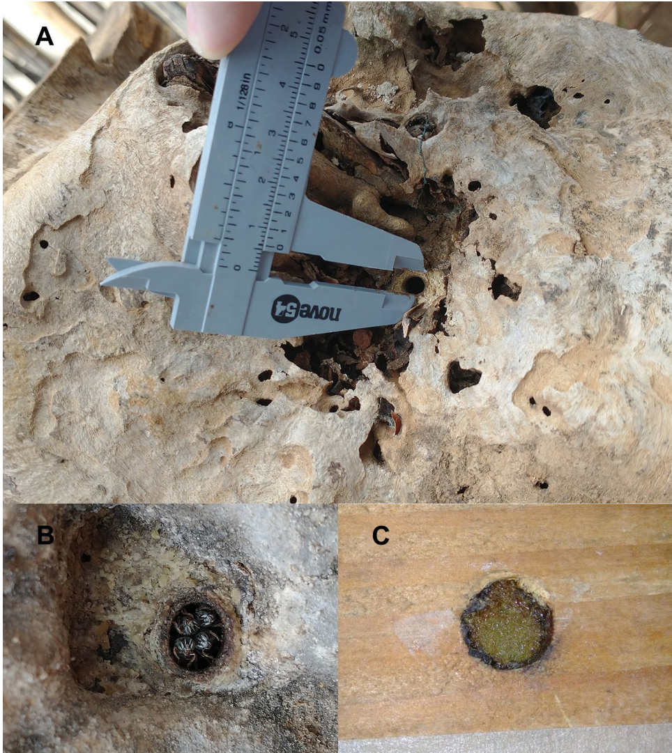
Figure 2. Entrance hole of the Plebeia flavocincta nest in a (A) trunk of Commiphora leptophloeos , (B) wall, and (C) manmade wooden hive with emphasis on the entrance hole closed at night.

the brood chamber and tunnels with curves close to the inner cavity wall of the nest. The length ranged from 5 to 6.5 cm with a mean value of 5.9 cm. In general, the tunnel is reinforced with a harder layer of cerumen (wax and propolis) and opens in the brood chamber of the nest