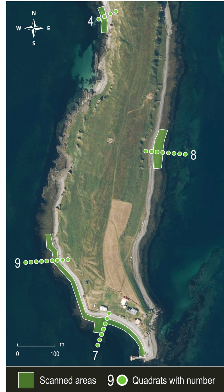
Figure 1: Schematic representation of Vigur Island's intertidal zone study areas (Basemap: Loftmyndir ehf).

The fieldwork was informed and supported by two key reference books, ensuring accurate species identification: Sept (2008) and Preston-Mafham (2010). These reference texts were instrumental in guiding the identification process throughout the study.