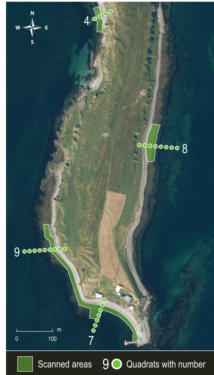
Figure 1: Schematic representation of Vigur Island's intertidal zone study areas (Basemap: Loftmyndir ehf).

The fieldwork was informed and supported by two key reference books, ensuring accurate species identification: Sept (2008) and Preston-Mafham (2010). These reference texts were instrumental in guiding the identification process throughout the study.