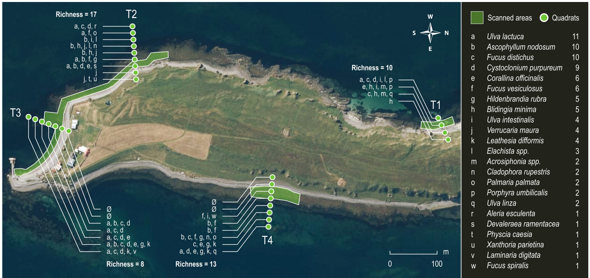
Figure 3: Distribution of the intertidal flora species found through the transect method on Vigur Island, Iceland.