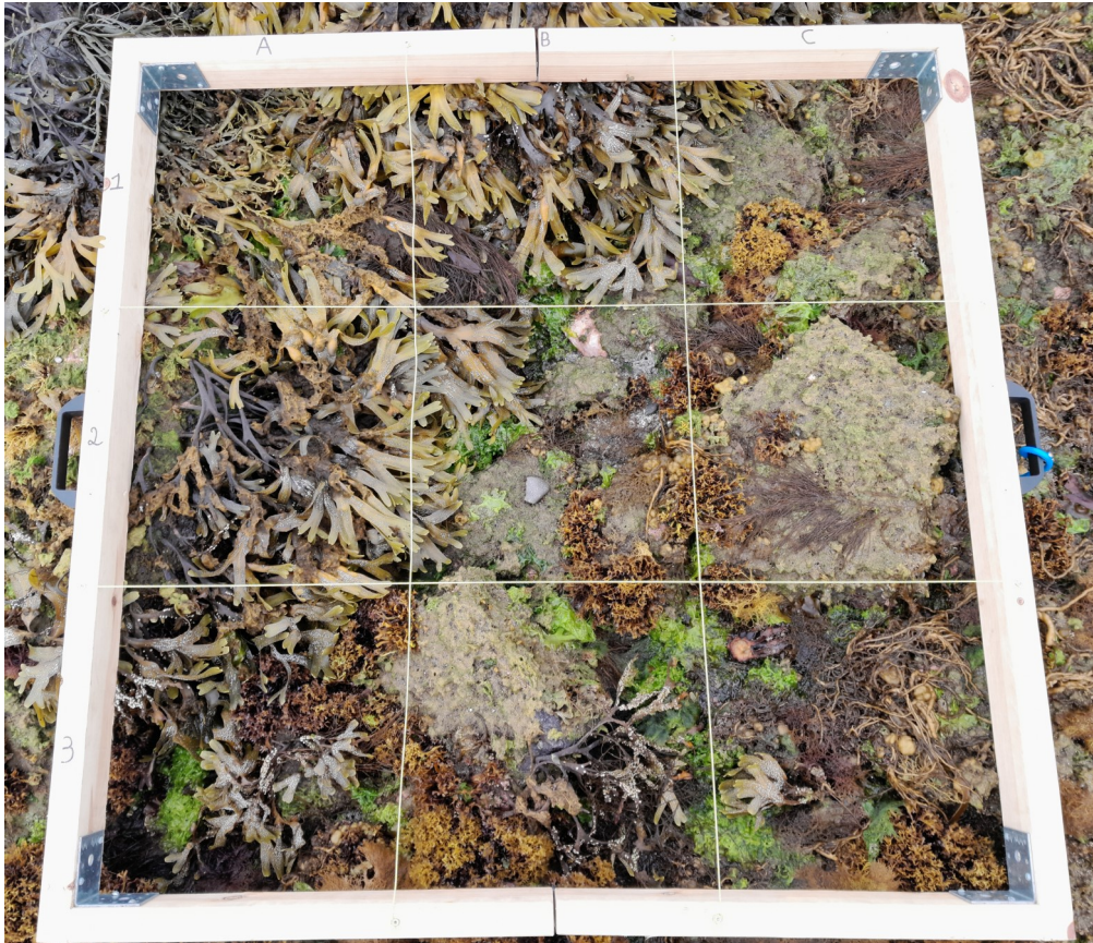
Figure 4: With seven identified species, the quadrat T3-Q6 was the one with the largest species richness in the intertidal zone of Vigur Island, Iceland.

colony. As for Transect T1, the area is frequented by a variety of bird species, including puffins, ducks, seagulls, and Northern Fulmars Fulmarus glacialis , who engage in activities such as feeding and swimming.