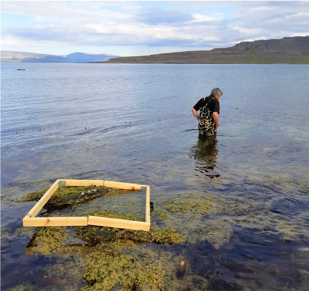
Figure 2: The observer scans around the last quadrat of a transect in the intertidal zone of Vigur Island, Iceland.