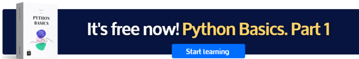
Figure 4 : It's free now. Try our Python Basics course. (source: reference [3] )

In conclusion, an introduction to Python programming targets beginners who are eager to learn a versatile language with wide-ranging applications. With its simplicity, widespread usage across industries, and availability of online resources for learning, Python proves itself as an ideal choice for beginners embarking on their programming journey. See references: [2] , [3] , [4] , [5] , [7] , [9] , [12] , [13] , [15] , [16] , [17] , [18] , [20] , [21] .