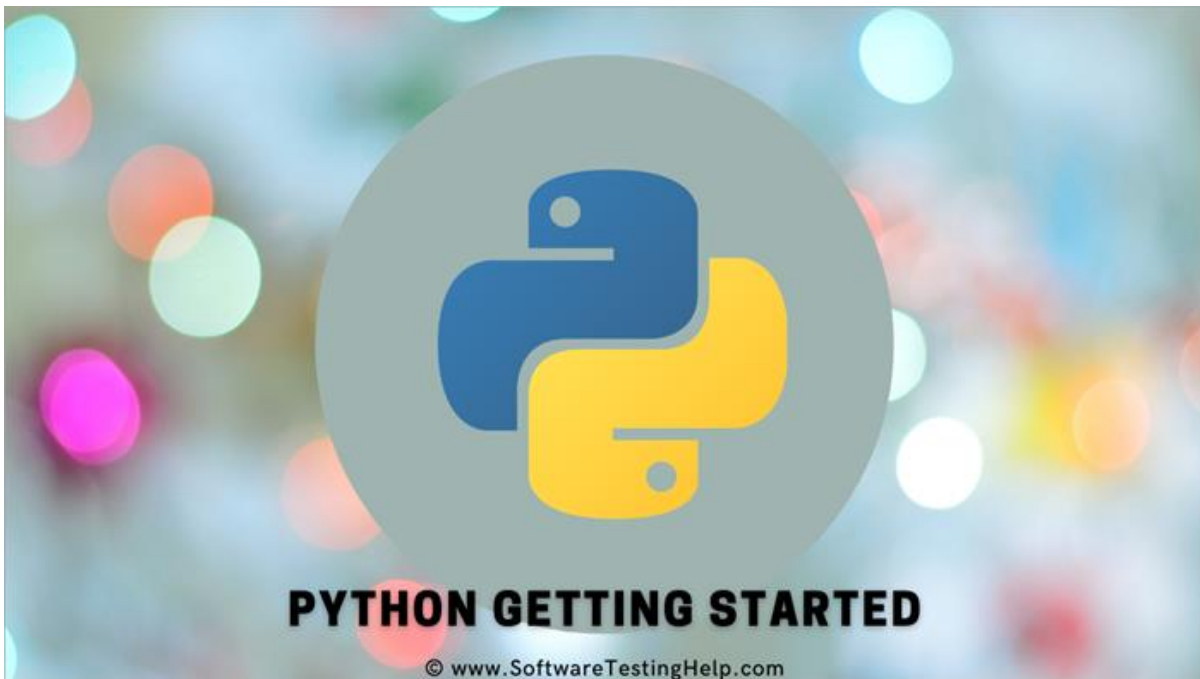
Figure 3 : Python Getting Started (source: reference [10] )