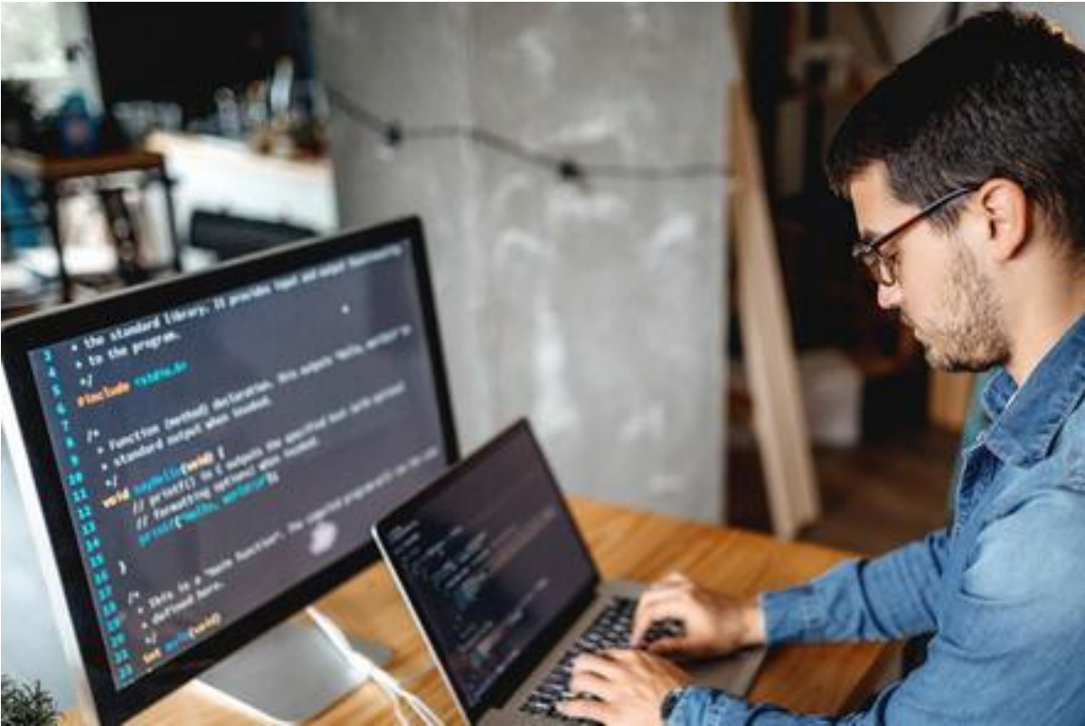
Figure 5: Data Science on Microsoft Azure Using Python Programming - cover image