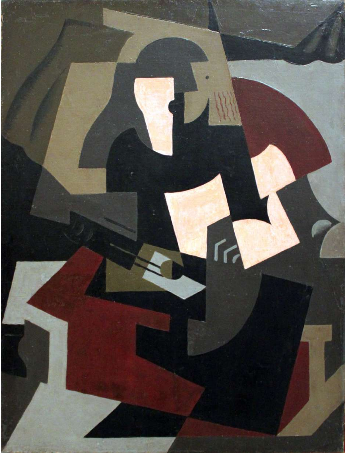
Fig. 4. María Blanchard, Femme à la guitare (Woman with Guitar) , 1917, oil on canvas, 100 x 72 cm, Collection Museo Nacional Centro de Arte Reina Sofía, inventory : AS01051