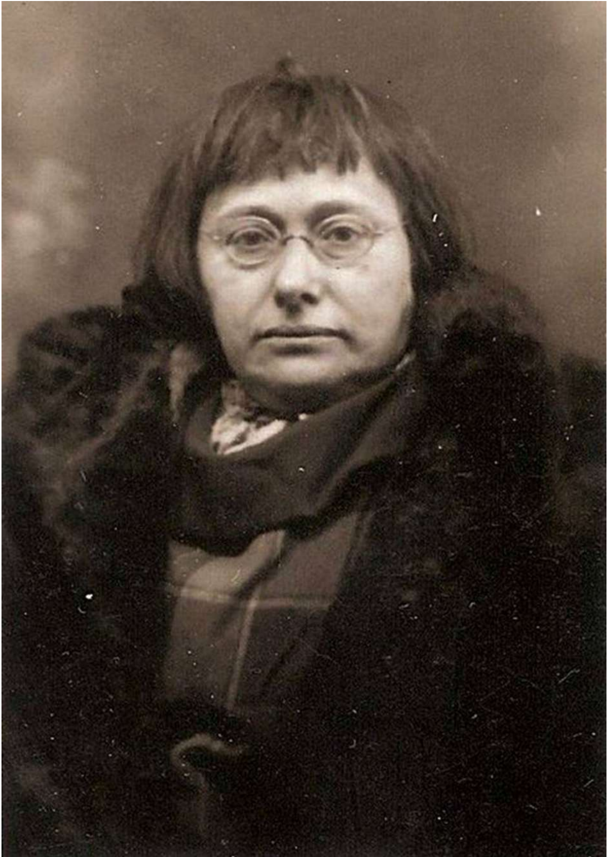
Fig. 7. Portrait of María Blanchard. Circa 1930.