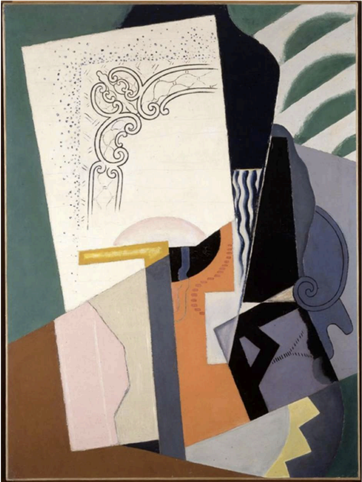
Fig. 3. María Blanchard, Composición cubista , 1916-1919, oil and collage on canvas, 154 x 114 cm, Collection Museo Nacional Centro de Arte Reina Sofía, inventory : AD00176