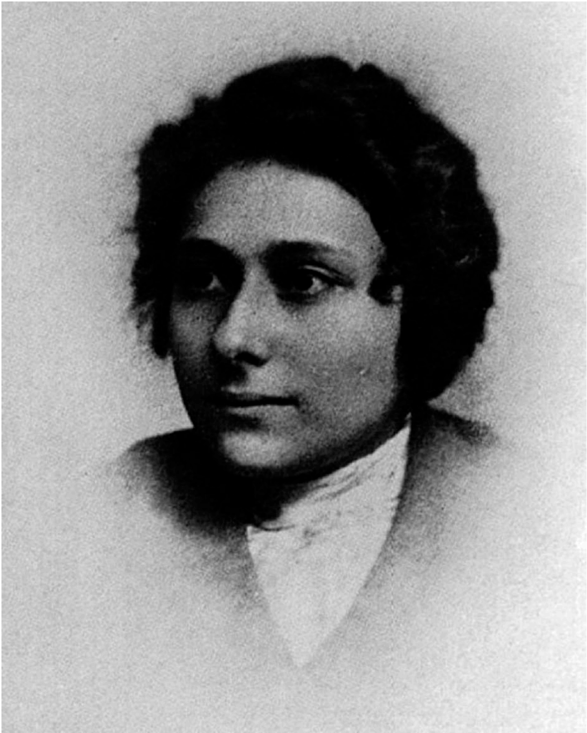
Fig. 1. María Blanchard young, 1909.