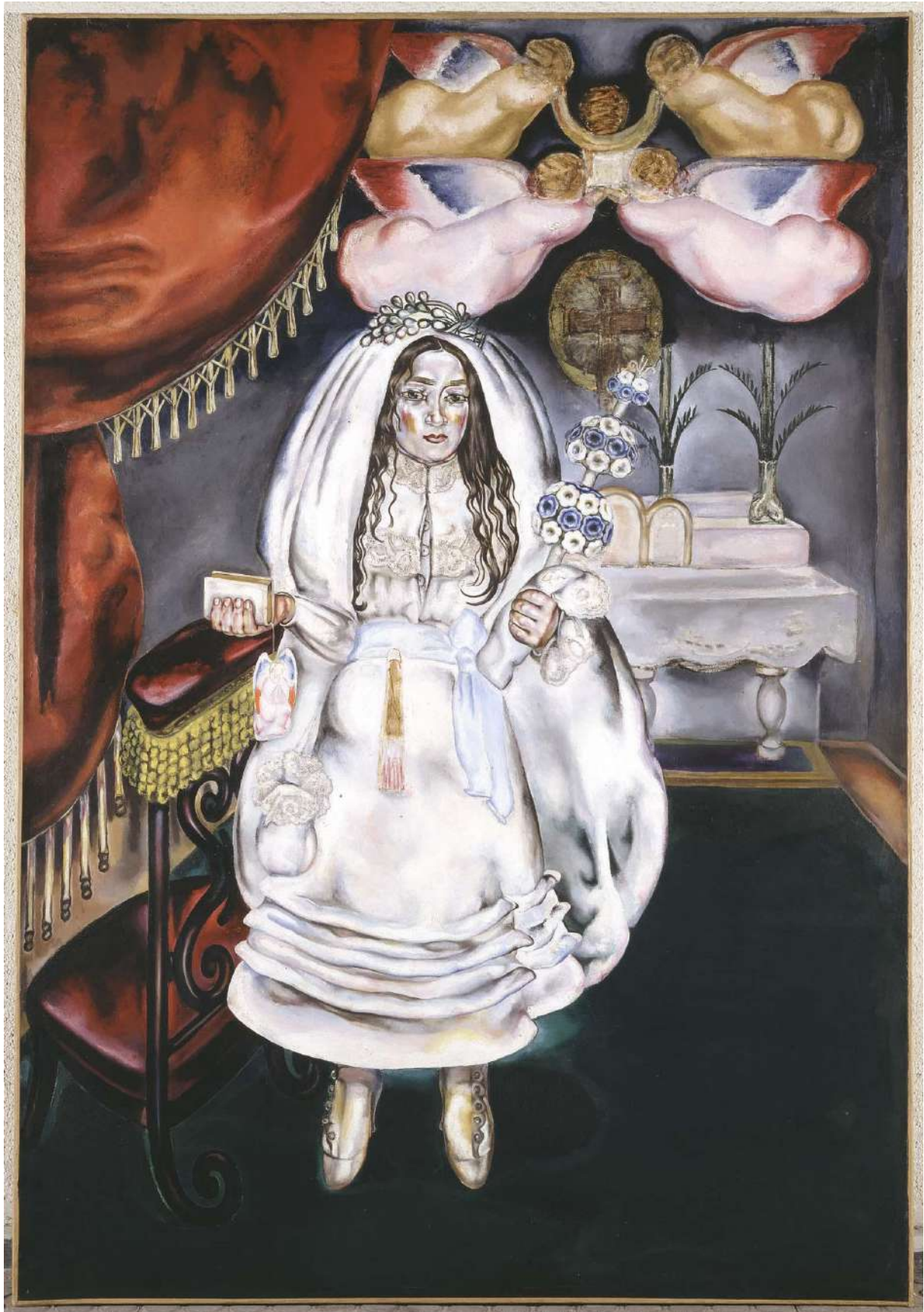
Fig. 6. María Blanchard, La comulgante , 1914, oil on canvas, 180 x 124 cm, Collection Museo Nacional Centro de Arte Reina Sofía, inventory: AS07281