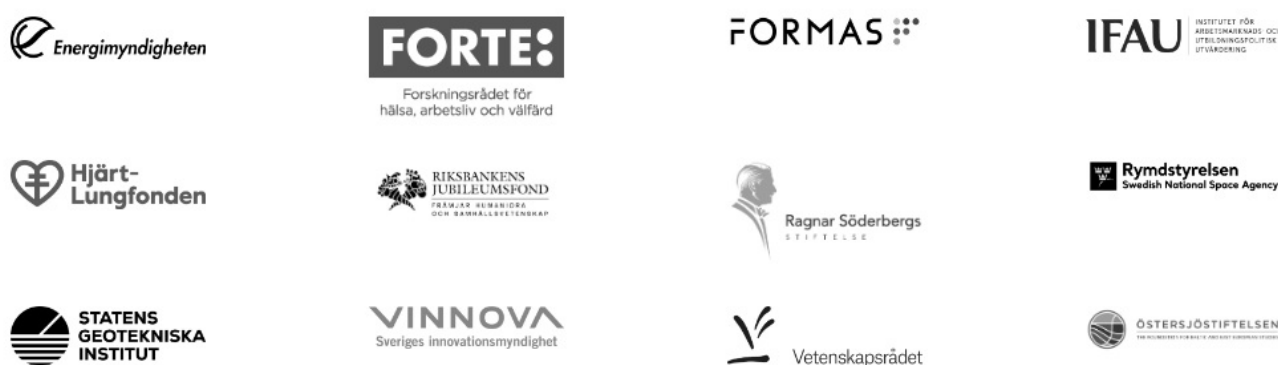
Figure 2. Swedish research funders (public and private) involved in SweCRIS

systems for collecting this kind of research information from funders. The fact that the standards for information exchange between the funders' systems and the SweCRIS national portal are directly discussed and agreed with funders means they are brought into a national-level research information management community that can also be a very useful forum when discussing PID implementation.