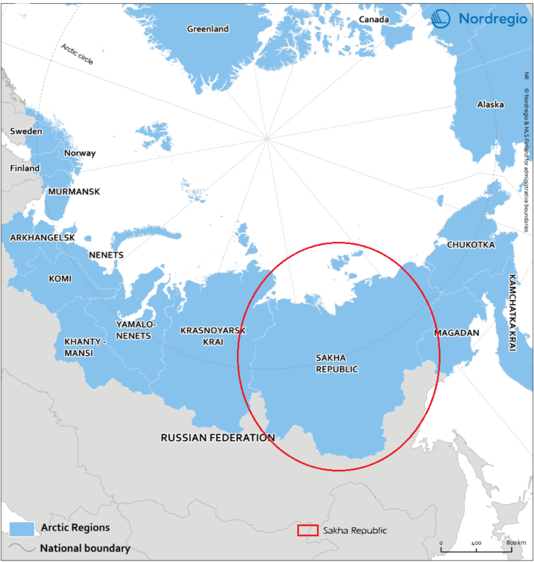
Map of the Russian Arctic: Elaborated by NORDREGIO