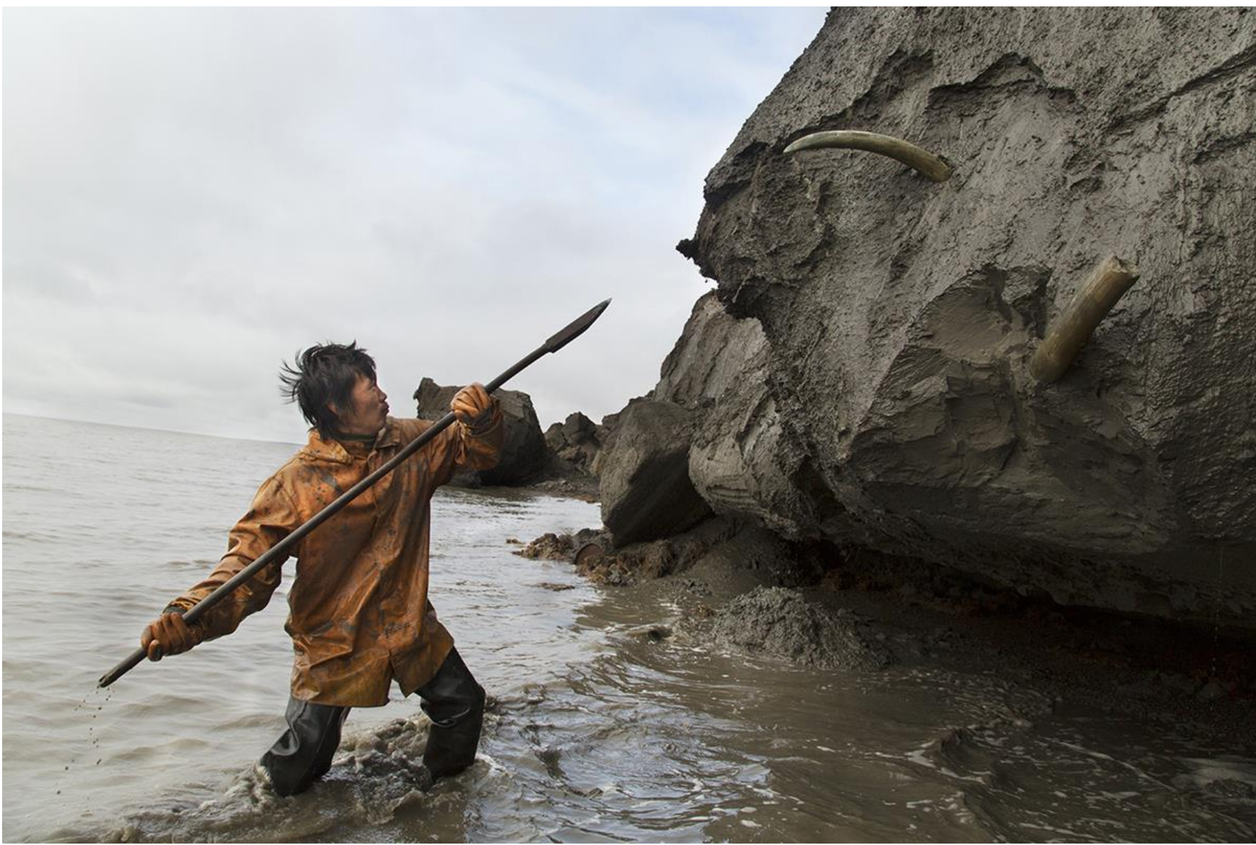
Mammoth hunter: Picture taken by Evgenia Arbugaeva

The aim is to share the results of the analysis of our interviews in order to identify the main themes that emerged and that can contribute to improve the understanding of the nature and extent of impacts on cultures triggered by changes on permafrost and climate in the Russian Arctic.