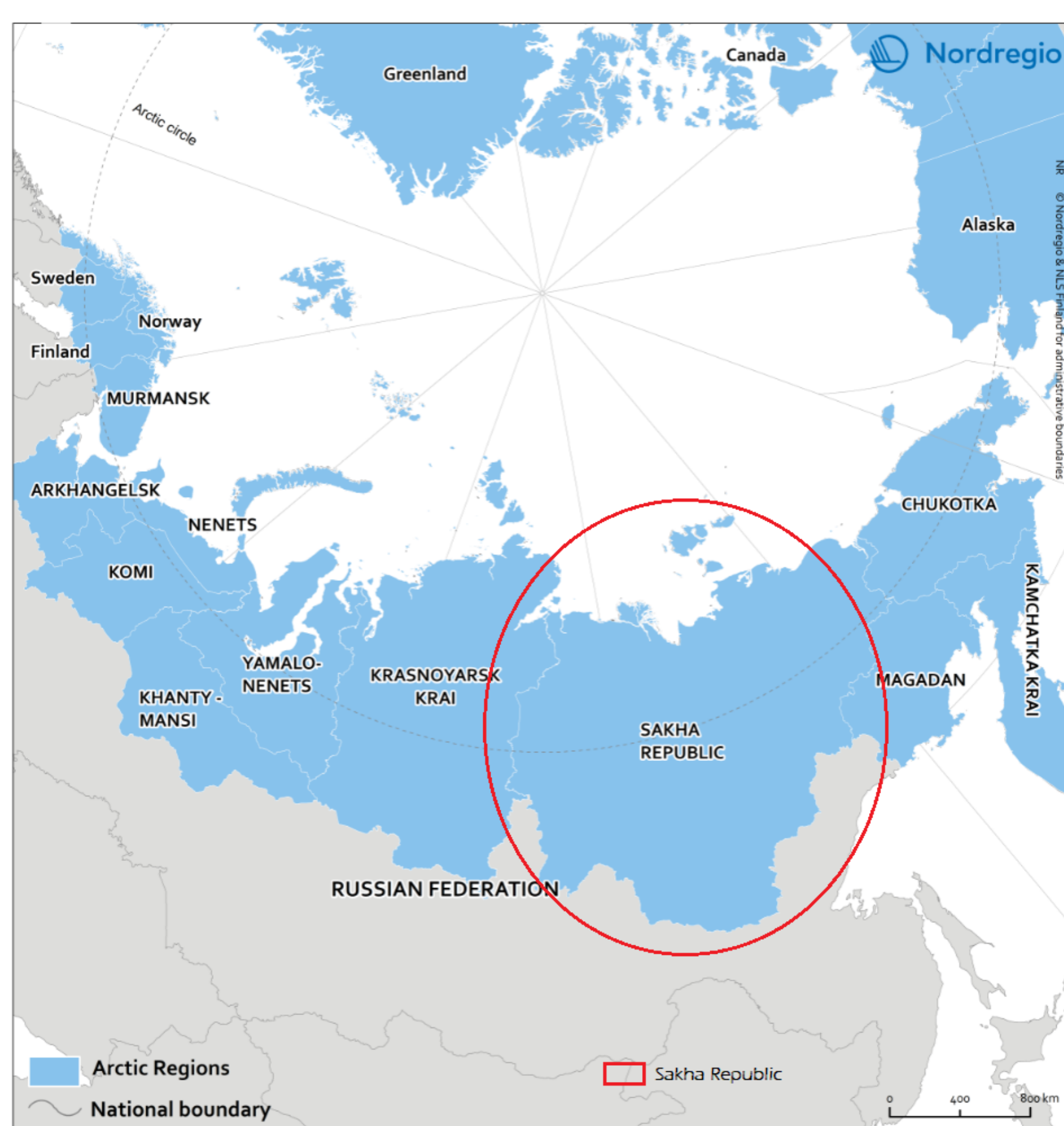
Map of the Russian Arctic: Elaborated by NORDREGIO