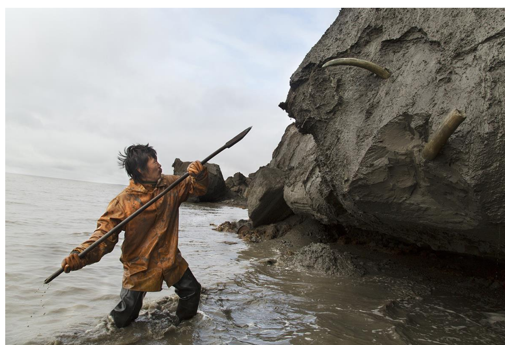
Mammoth hunter: Picture taken by Evgenia Arbugaeva

The aim is to share the results of the analysis of our interviews in order to identify the main themes that emerged and that can contribute to improve the understanding of the nature and extent of impacts on cultures triggered by changes on permafrost and climate in the Russian Arctic.