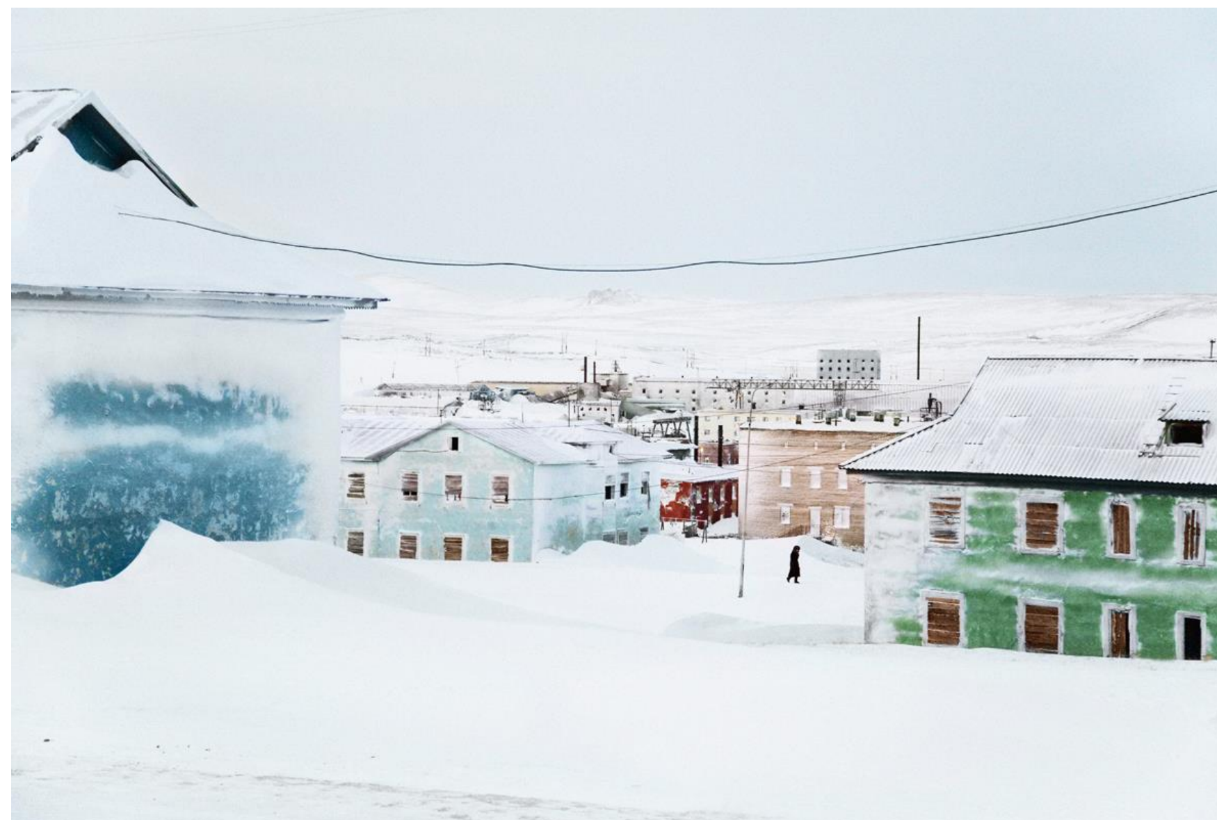
Tiksi: Picture taken by Evgenia Arbugaeva