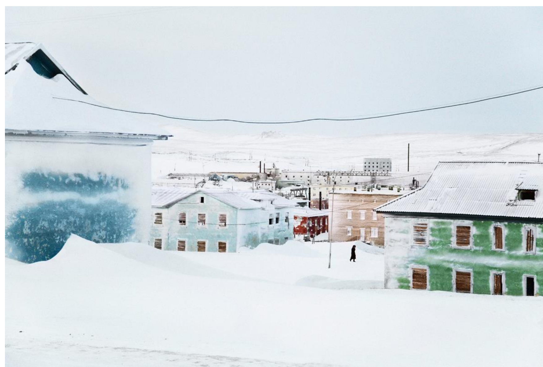
Tiksi: Picture taken by Evgenia Arbugaeva