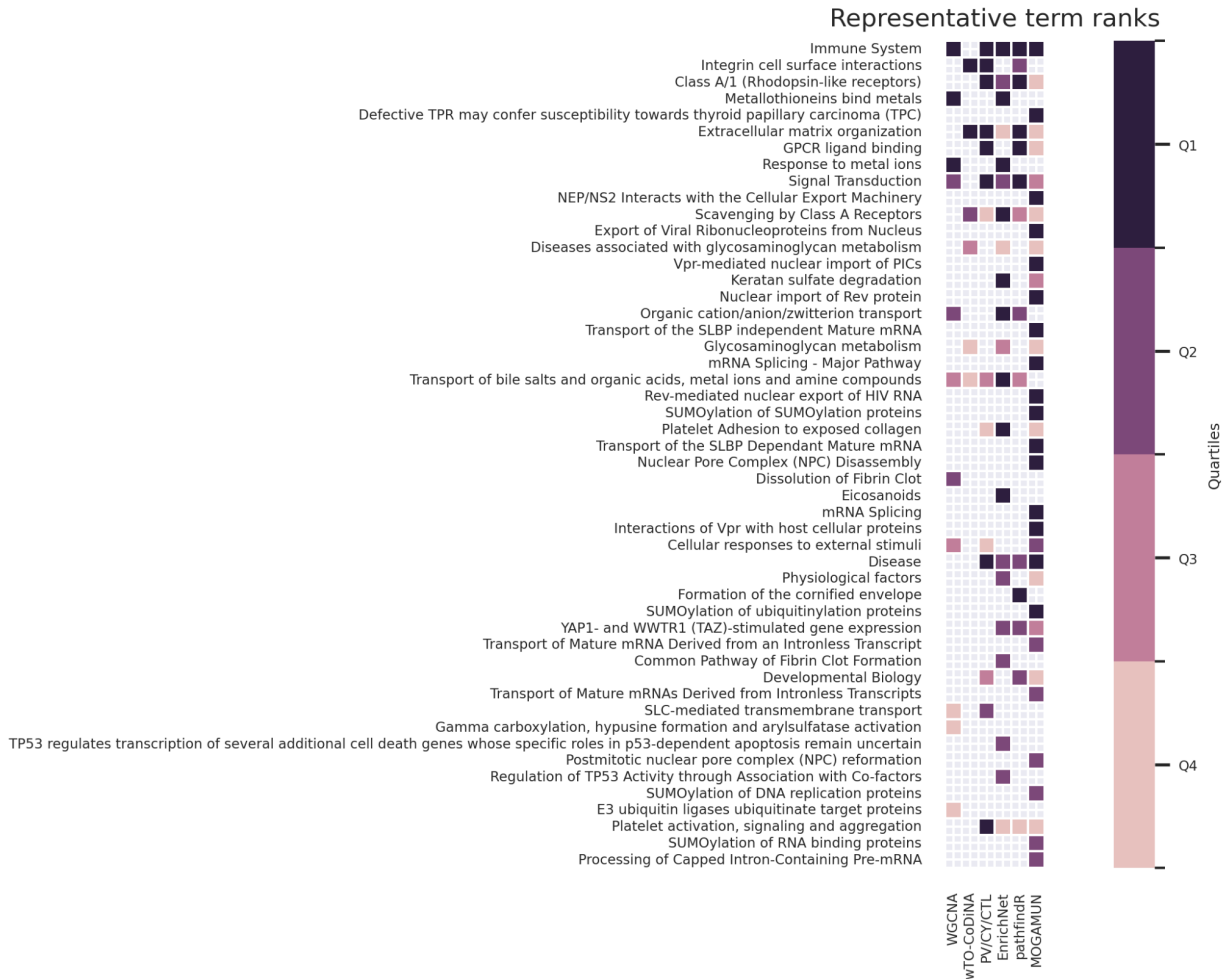
Figure 2. Result of Reactome pathway enrichments from the six network-based methods, summarized by orsum. The top 50 terms are presented.

we discuss both the representative Reactome terms and their associated subterms that emerged as significant in our analysis.