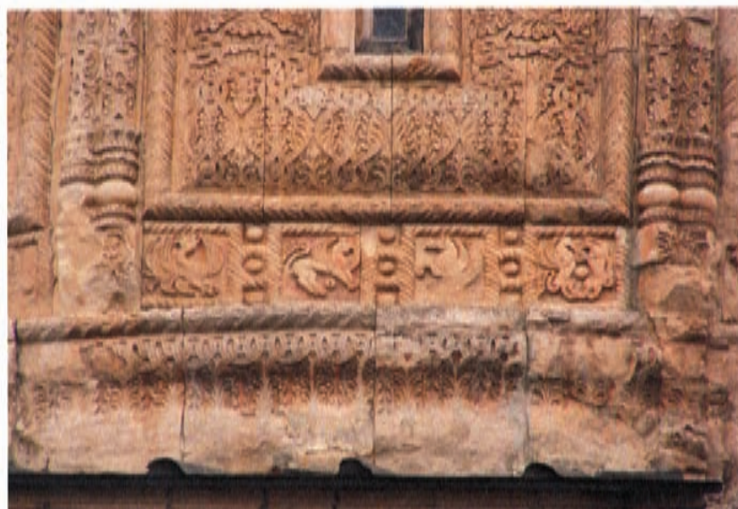
7. Nikortsminda. A pask'unji. The dome's frieze. 1014 year.