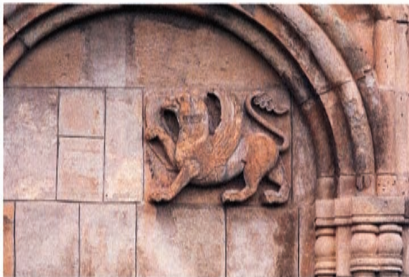
8. Samtavisi. A pask'unji, 1030 year.