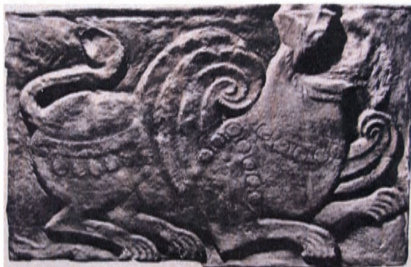
1. Khakhuli. A pask'unji . South Portico. Second half of Xth century.