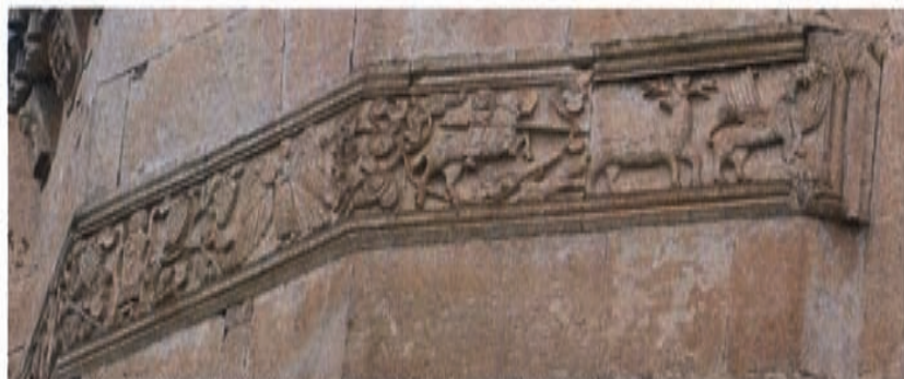
5. Martvili. A pask'unji. The frieze of a western facade. Xth century.