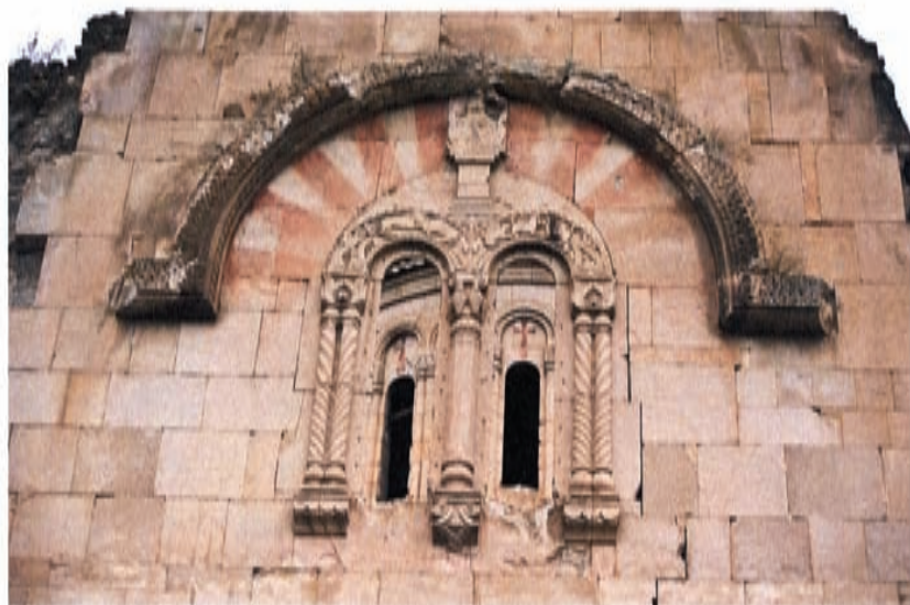
4. Oshki. A couple of pask'unjis. Western window's frame, 963-973 years.