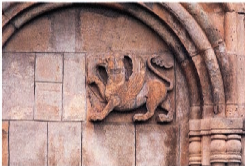
8. Samtavisi. A pask'unji, 1030 year.