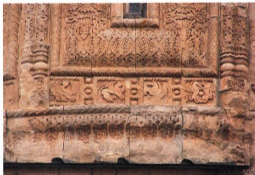
7. Nikortsminda. A pask'unji. The dome's frieze. 1014 year.