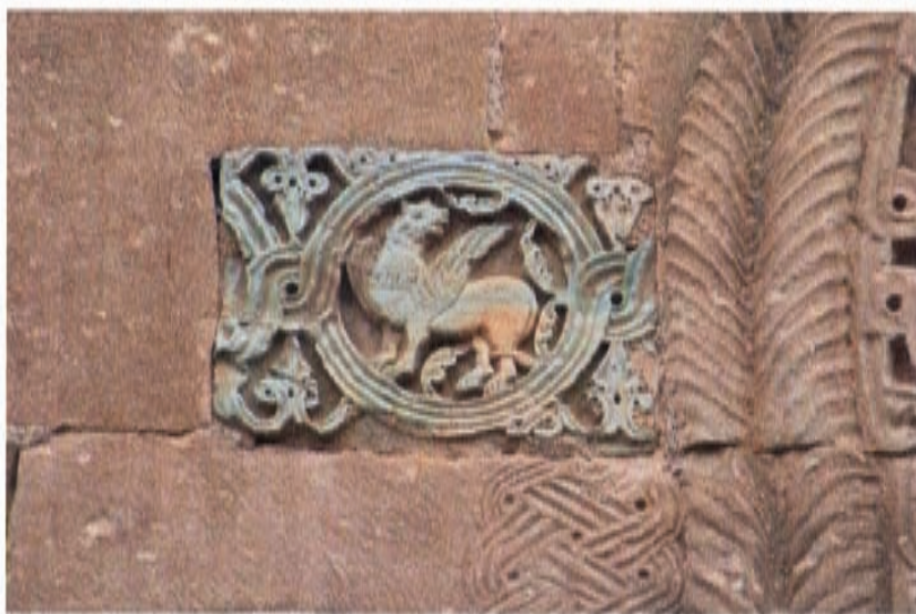
9. Ruisi. A pask'unji, XIII century.