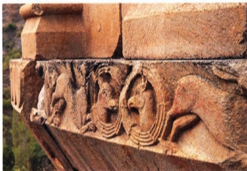
3. Oshki, the frieze of the dome. A pask'unji. 963-973 years.