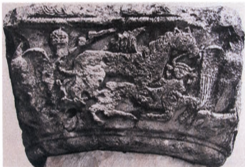
6. The Bagrati cathedral. A composition with pask'unji. A capital of portico. 1003 year.