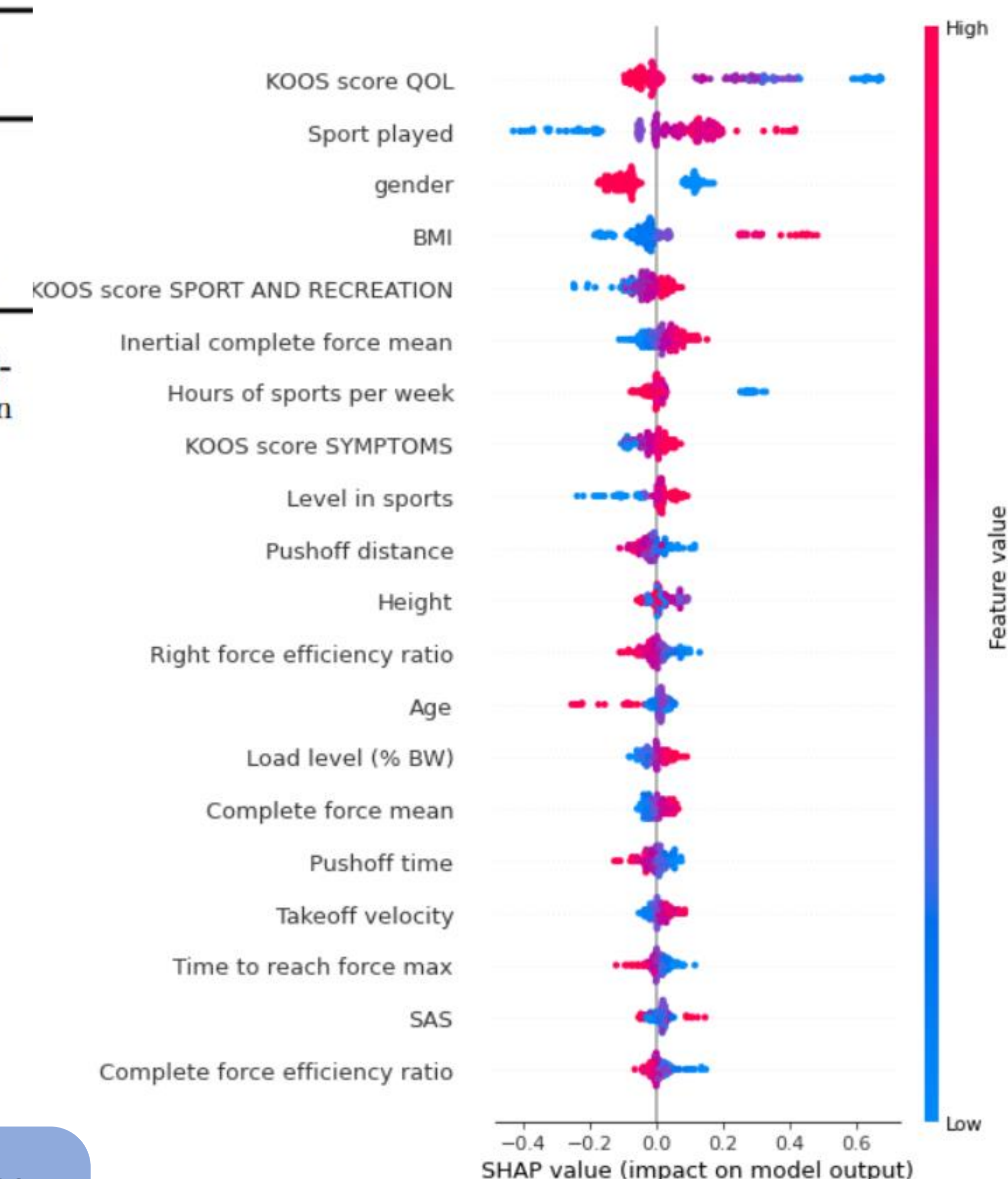
Fig 3 : In general, the most important attributes for the best MLP classification of push-offs and their impact on the prediction. Red points means high feature value, blue points low feature value, points on the right increase the prediction score of knee injury sequelae, points on the left decrease this prediction score

Discussion, Conclusion: This study shows that as expected deep learning based techniques achieves a better result than DT (Table 4) and than previous studies doing the same type of experiment [5]. As a consequence, the most important features for classification are more accurate and can be interpreted as risk factors of knee injuries. Particularly, psychological factors (KOOS scores) and informative attributes (sport played, body mass index) are generally more important than variable describing performances on the test (Fig 3). However, these results must be confirm on a larger cohort like in [5] to have a correct spread of our results.