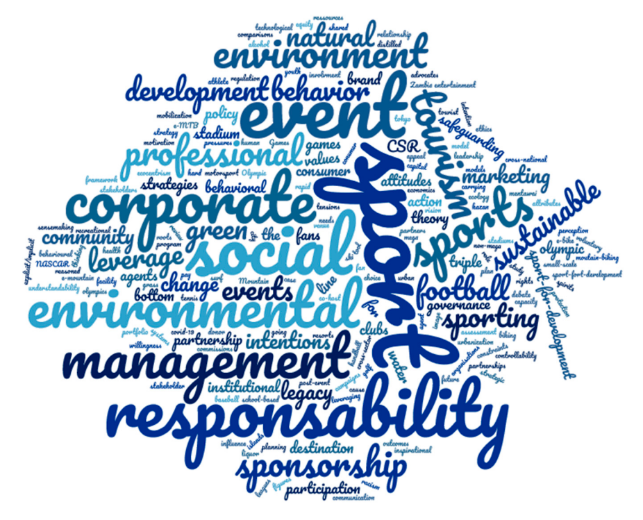
Figure 2. Display of keywords in sustainability-in-sport-related articles.

Figure 2 shows that the top three keywords used were "sport" (n = 44), "event" (n = 16) and "responsibility" (n = 11) out of a total of 213 different keywords. A word cloud designed with MonkeyLearn has been provided.