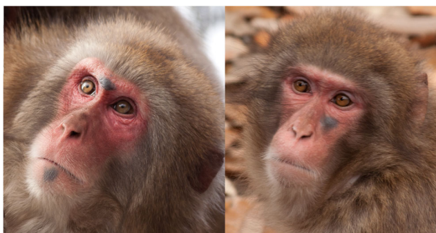
Fig. 2 Images showing one of the darkest female faces (left) and one of the lightest female faces (right) across all images used for color analyses ( N = 12 females and 292 pictures)

We then performed LRTs comparing each of the four full fitted models to their respective null models in which the predictor variables were removed but the random effect structure was maintained. If a full model outperformed its respective null model, we then tested the statistical significance of each predictor variable using LRTs, comparing the full model to reduced models in which single predictors were removed in order to get the overall effect of this predictor. We also report estimates and pairwise comparisons across all factor levels of each full model for a better interpretation of our results. We report parameter estimates with their respective 95% confidence intervals. Our statistical approach forces comparisons of all categorical predictor levels against a baseline intercept term (here: the fertile phase by default for cycle phase). To obtain pairwise comparisons across all factor levels, we relevelled this factor (setting the pre-fertile phase as the baseline) and re-ran models as necessary. We did not further report on parameter estimates of full models that did not outperform their respective null models. We ensured that all relevant model assumptions were met by visually inspecting histograms of