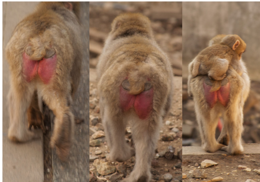
Fig. 1 Images of one female hindquarters across different cycle phases of one menstrual cycle: pre-fertile phase (left), fertile phase (middle), and post-fertile phase (right)

353 mixed-effects models (LMMs) fitted by maximum likelihood 354 to examine variation in female facial and hindquarter coloration 355 separately using nlme (Pinheiro et al. 2014) and lmerTest 356 (Kuznetsova et al. 2017) packages in R version 3.3.3. We 357 checked for correlations between our predictor variables to 358 avoid potential confounding effects of multi-collinearity. 359 Female parity did not correlate with body mass ( r_s = -0.49 , 360 P = 0.10 , N = 12 ) or rank ( r_s = -0.24 , P = 0.45 , N = 12 ). 361 Female body mass was not correlated with rank ( r_s = -0.03 , 362 P = 0.94 , N = 12 ).