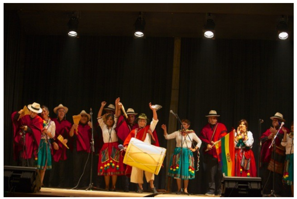
Fig. 3: Collective Bolivian folkloric dance in Geneva (Eduardo Herrera, 2013 Fiesta de la unidad)

Here, dance places itself at the intersection of those ambiguous lines of in visibilities where hiding and revealing are used in synchronicity as "moments of control" (in Guillermo's words) over self-representation towards an audience. During performances, dancers can 'show' their bodies in a controlled manner; through choreographies, chosen clothing, setting, etc.—they are in charge of the image created of themselves reflected to the audience. Guillermo points to the intersubjectivity of dance: "Without an audience, the interest in dance disappears, the notion of performance disappears." As for other members of the community, "being in the audience is therefore an essential way to participate in dance, it is a way to complete the dance." Talking about the importance of dance for the Kosovan community, which is pejoratively stereotyped in public discourse<sup>84</sup> and also highly impacted by the 'sans-papiers' phenomenon, Floreta Yashadi (interviewed on 11/22/2021), former 'sans-papiers' from Kosovo who arrived in Geneva in 2009, highlights how dance events are a way to "share my culture with Swiss friends who do not know much about Albanian culture." In other words, this form of spectatorship created through performance retains the potential to challenge the securitized gaze imposed upon 'undocumented' migrant bodies, shifting the threatening spectacle, or specter, into one of humanized collective cultural expression.