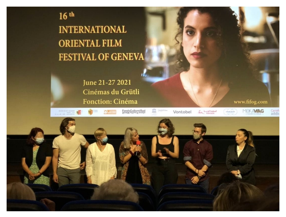
Fig. 5: Screening of Elles les (in)visibles in Geneva with the four women (2021)

four women unexpectedly decided to come on stage to participate in the Q&A. In this moment, embodied agency as a form of collective resistance became palpable. Indeed, not only did these four women make the choice of visibilizing their stories through a film, but they all agentially visibilized their bodies in front of a crowd who bared witness to their personal testimonies for 64 minutes, with the threat of legal repercussions this could have entailed (see Fig. 5 below). In this way, the gaze became a two-way relationship where the subject looked back to the spectators. "When gazing at another person who looks back, we feel a mutual recognition of life," write Eric Kramer and Elaine Hsieh. Physically facing the embodiment of the women's stories, the audience could not escape the profound insight into their realities, which made it question the preconceived securitized images of 'undocumented' migrants. Embodied testimonies through film thus enabled the collective voices of these 'undocumented' women domestic workers to agentially position their body within the in visible as a form of resistance.