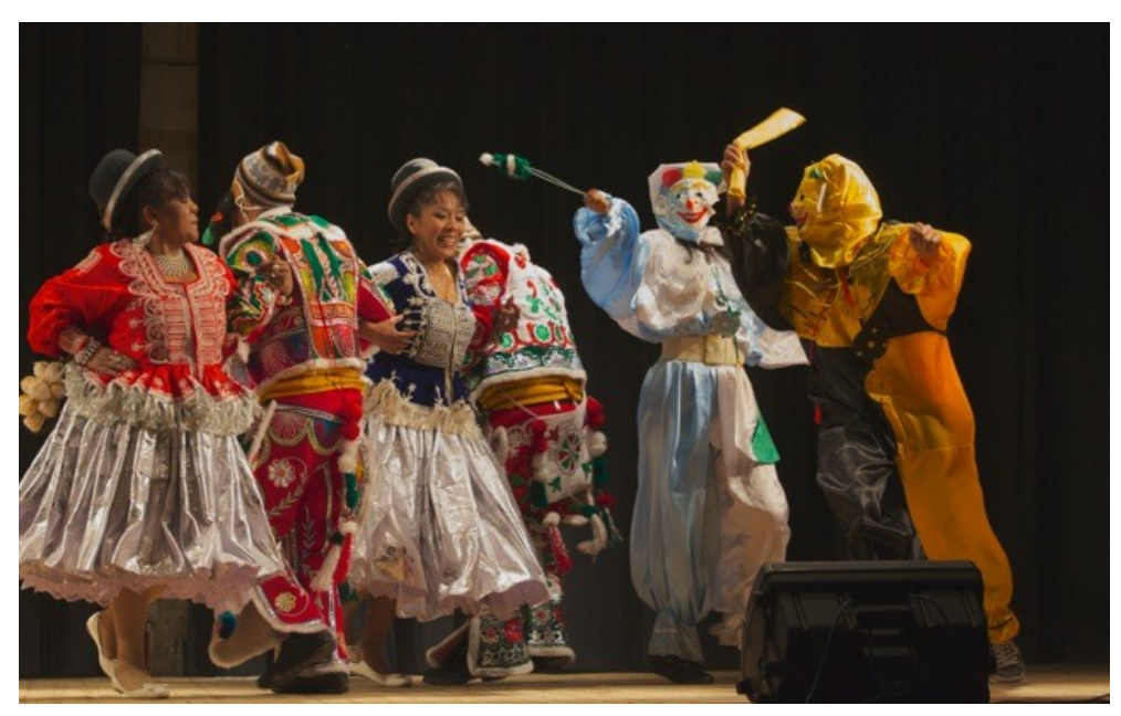
Fig. 2: Bolivian folkloric dance in Geneva with masks (Eduardo Herrera, 2013 Fiesta de la unidad)

'undocumented' realities while nonetheless "revealing aspirations, for example aspirations of respect," insists Guillermo. Agentially shifting from their situation of clandestinity into one of being an artist on stage becomes a fundamental form of resistance to their condition. Guillermo explains: "undocumented' immigrants are vulnerable at the tram stop in Cornavin, but they will feel safe on stage. This visibility as artists protects them. The visibility of the stage protects them. The public protects them. It's a safe space." The collective aspect of these disguised performances also plays a role in providing a platform for 'undocumented' workers to blend in amongst people with legal status, allowing to draw upon the power of anonymization—similarly to the crowds during protests (see Fig. 3 below).