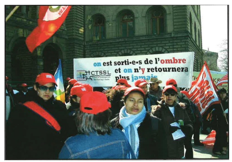
Fig. 1: Picture issued from CTTSL's 2004 activity report

Their bodies 'speak' in ways that reclaim their humanity within the existing securitized visual field. The securitization of migration has amalgamated migration with illegality, abuse, crime and even terrorism; this amalgamation has been encapsulated in the threatening figures of the 'Clandestin' or the 'Illégal'<sup>79</sup>. The collective embodied assembly has offered an alternative to this securitized gaze, that is, a counter-gaze. Indeed, giving a face to the 'illegal immigrants' demystified them or, in more theoretical terms, has worked towards the de-securitization of migration. Back then, Silvia and the collective CTTSL elucidated the raison d'être of their mobilization in this same light: