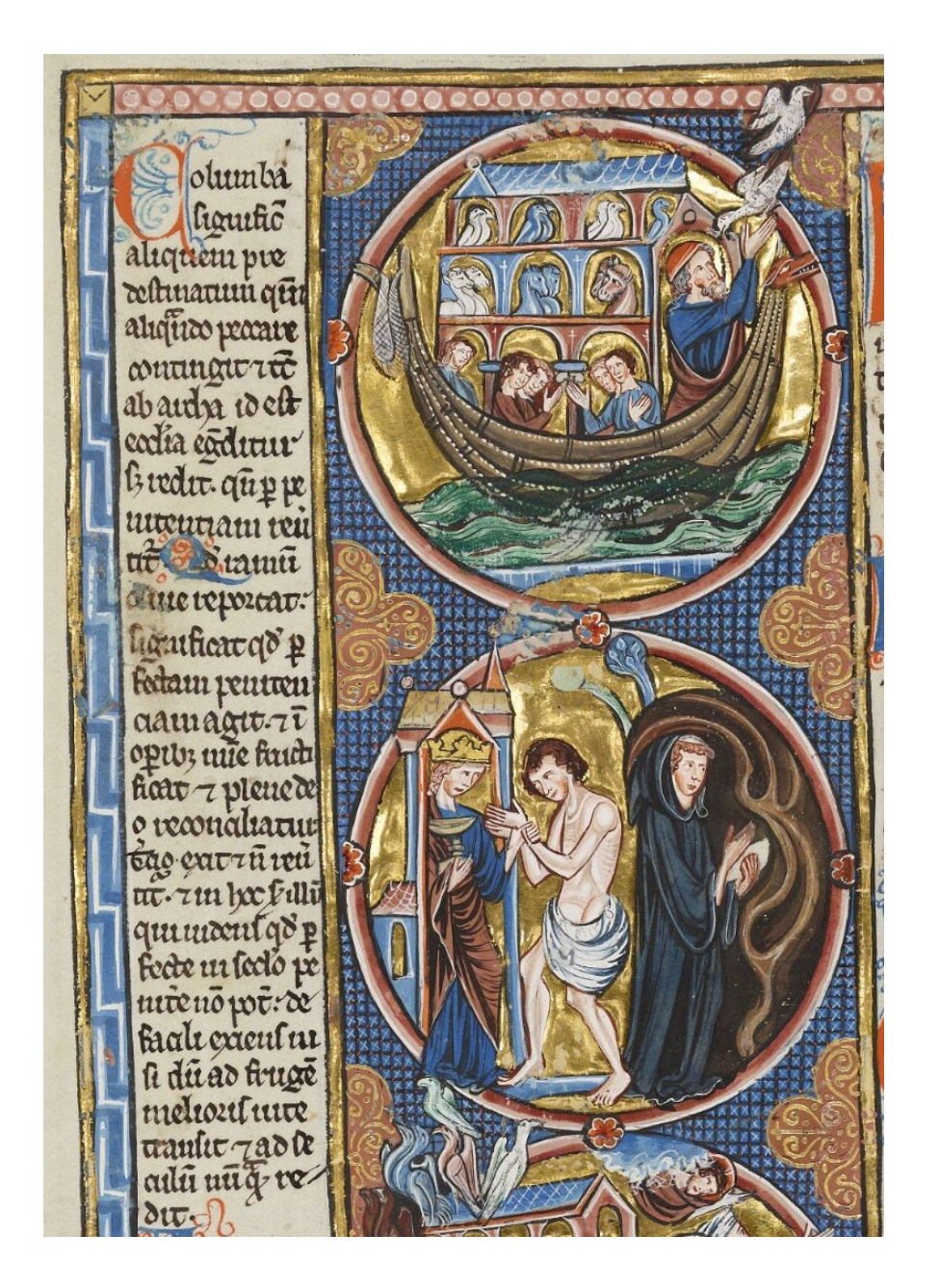
ill. 4: Oxford, Bodleian Library, MS Bodley 270b, fol. 10 (A/a), c. 1234-55.