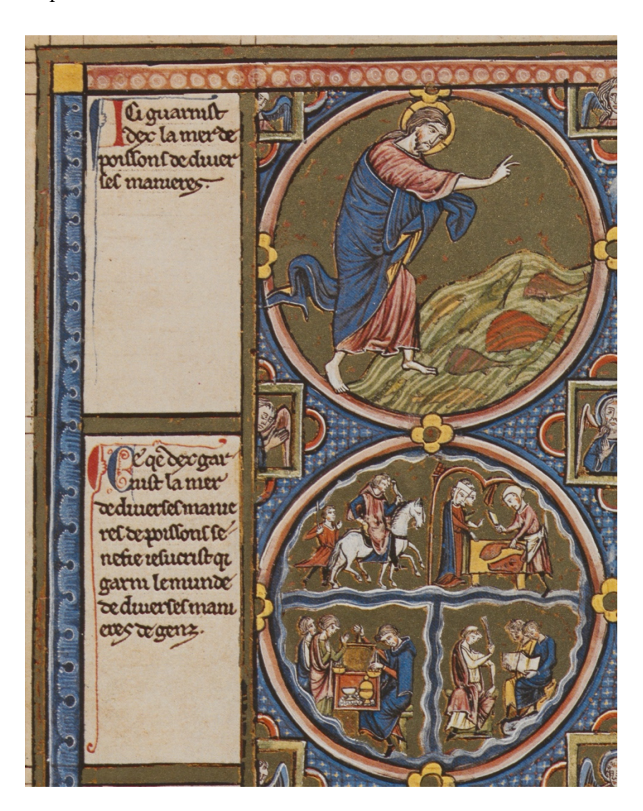
ill. 1: Vienna, Österreische Nationalbibliothek, Codex Vindobonensis 2554, fol. 1v (A/a), c. 1220-23.