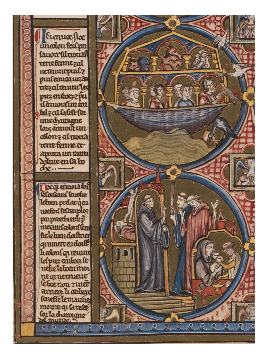
ill. 3: Vienna, Österreische Nationalbibliothek, Codex Vindobonensis 2554, fol. 3 (B/b), c. 1220-23.