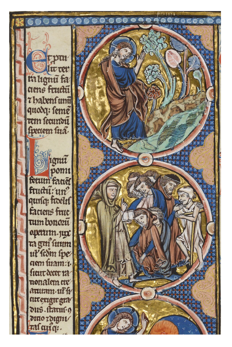
ill. 5: Oxford, Bodleian Library, MS Bodley 270b, fol. 4 (A/a), c. 1234-55.