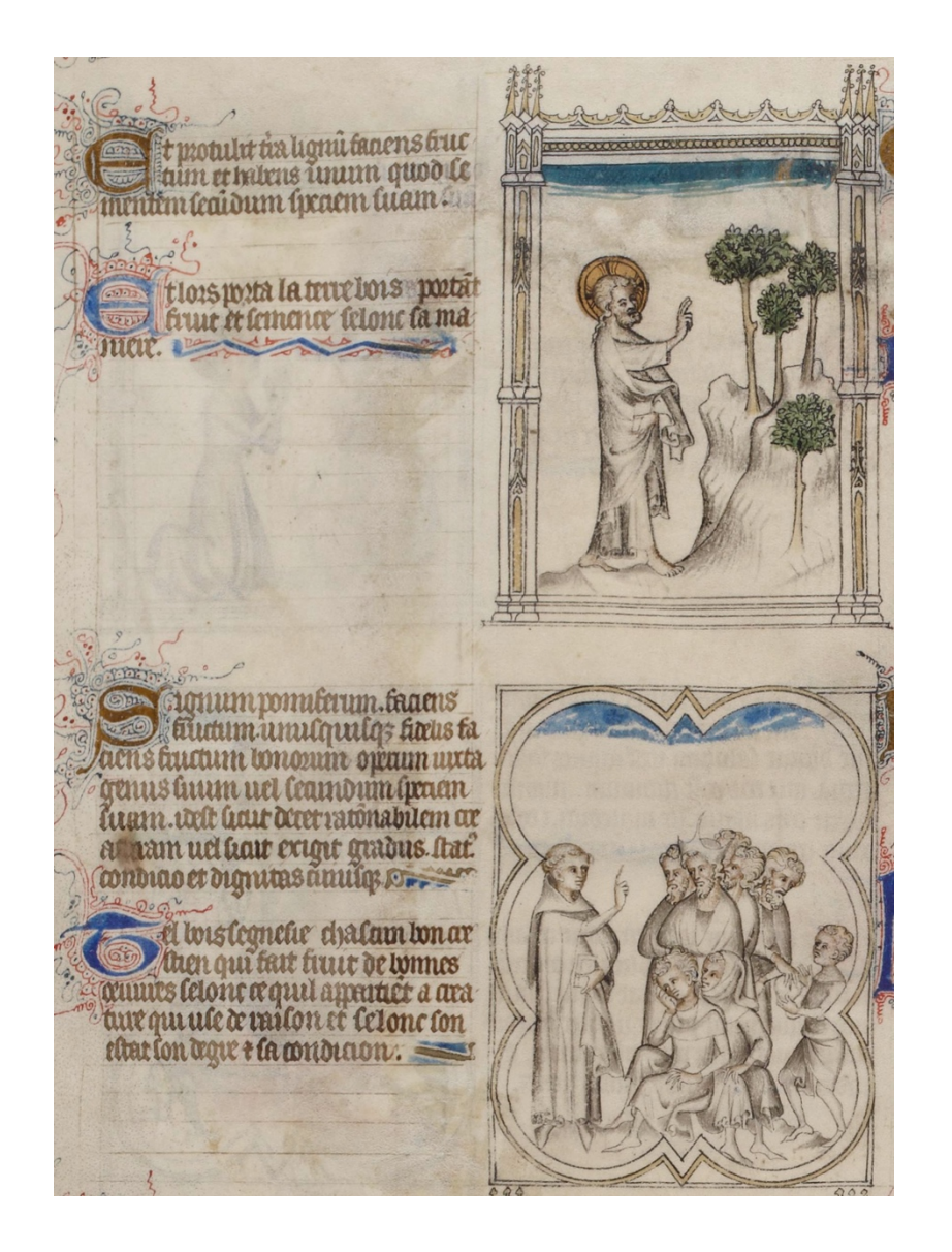
ill. 6: Paris, Bibliothèque nationale de France, fr. 167, fol. 2 (A/a), c. 1349-52.