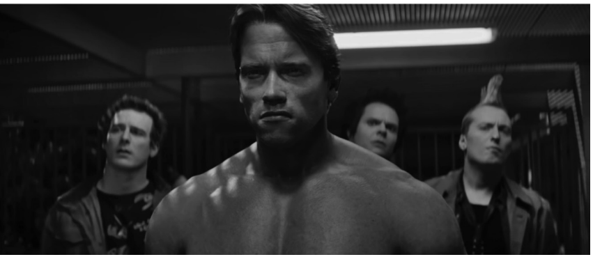
Fig. 3 - Schwarzenegger and his digital alter ego in Terminator Genisys (2015)