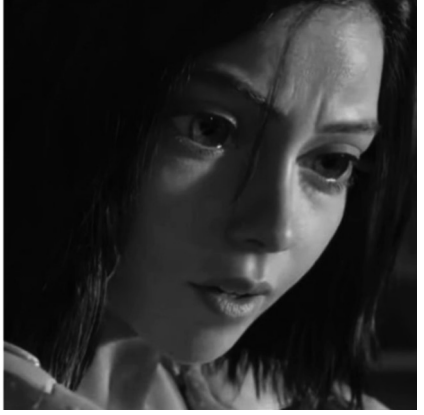
Fig. 2 - Rosa Salazar performing her digital character in Alita: Battle Angel (2019)

According to Jacques Aumont, the real face is not the one visible, but the spiritual form to which this visible face alludes<sup>25</sup>. In order to ward off the frightening superficiality of digital faces, animators and engineers develop techniques aimed at capturing the face as a spiritual substance, the back-face of which the face is the mask, beyond the simple image of the face. This is what may be called digital epiphany, as opposed to mimetic ideology. In contrast to human faces in the humanist age, represented for themselves, digital faces in the digital age are open to transcendence, and renew with religious iconology, connecting the spiritual nature of the image and its sensible appearance.