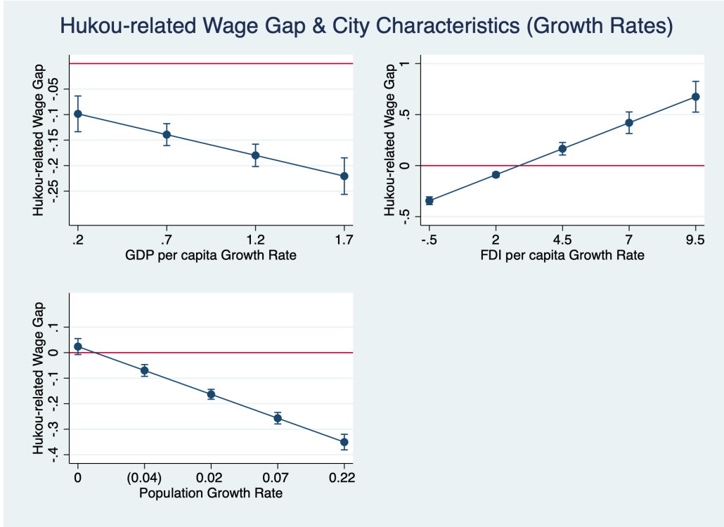
Figure 3: Discrimination Intensity & City Factors (Growth Rates)

(Figure 2). It is actually nil in places that have the lowest population and level of FDI per capita in our sample, and steadily increases afterward, to become quite large in the places that are at the top of the distribution of these variables in our sample. In a parallel way (Figure 3), this wage gap increases in places that are more dynamic in terms of population and GDP per capita. These results seem in line with the existing literature. As discussed above (section 2.1.4), more developed and dynamic localities tend to have more stringent hukou policies (e.g. Colas and Ge, 2019), to generate more agglomeration externalities, that disproportionately benefit urban residents (Combes et al. , 2020), and their residents tend to display more prejudice toward migrants (Wang et al. , 2021b). But our results do not allow to discriminate between these potential causality mechanisms.