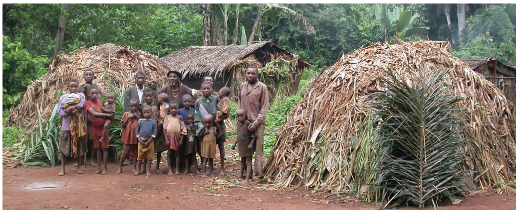
Fig. 2 - A group of Baka Pygmies in a camp near Le Bosquet in south-east Cameroon. The Baka love to stay in the camps deep in the forest, in their own environment and far from the areas under the influence of the "Big-blacks". The entrance to the mongulu is concealed by a raffia palm leaf, which recalls the description given by Du Chaillu, still valid today: "little branches of trees had been stuck up in front to show that the inmates were out, and that their doors were shut, and that nobody could get in" ( In the country of the dwarfs 1872 , p. 254).

what identifies the Pygmies from a socio-cultural perspective is their confrontational interaction with other groups (Bahuchet 1993b, 2012). Therefore, the term 'pygmy' has a strong socio-cultural meaning. Who is a Pygmy and who is not is quickly identified by the individuals (Pygmies and non-Pygmies) who inhabit equatorial Africa.