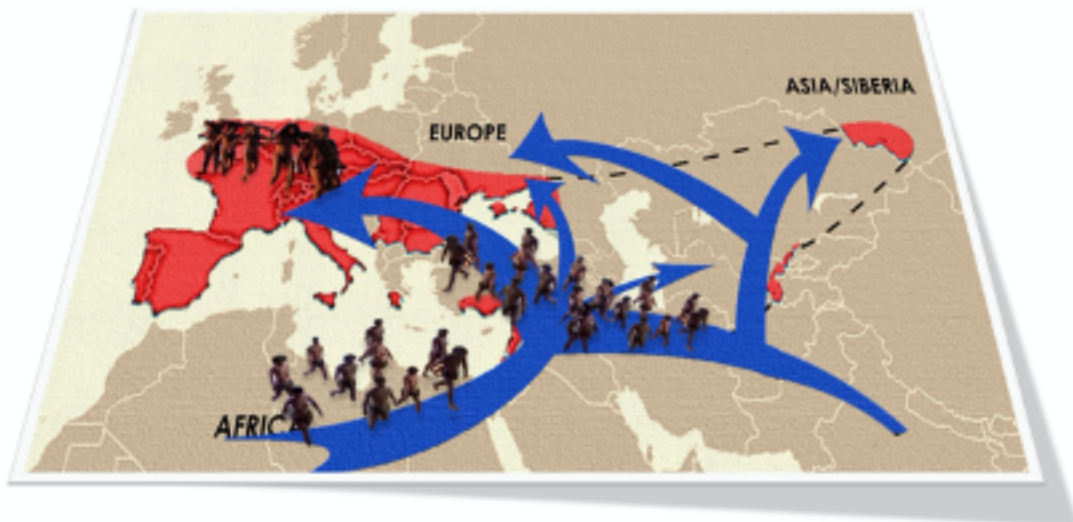
Figure 15.2: The differences between IntCal13 in green and IntCal20 in purple. The spread of Homo sapiens (blue rows) and Neanderthals (red zone) on a geographical map.