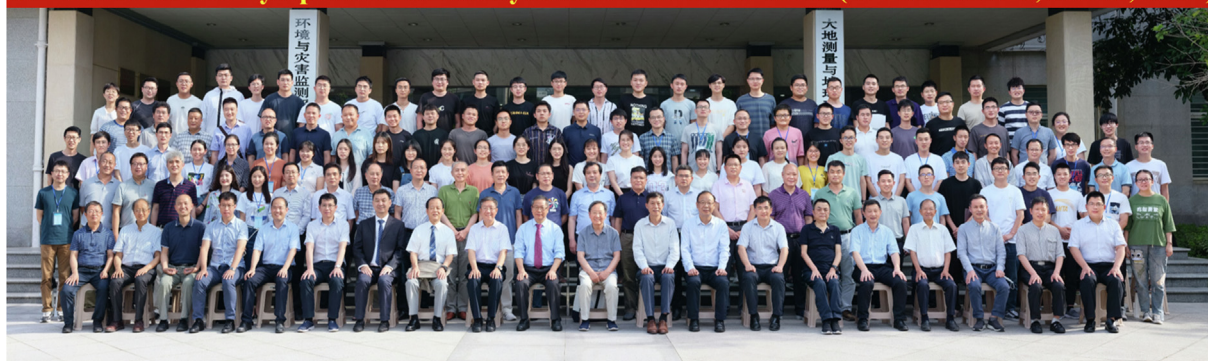
a) 第19届“地球动力学与固体潮”国际学术研讨会（中国武汉，2021年6月23日-26日） 19 th International Symposium on Geodynamics and Earth Tides (23-26 June 2021, Wuhan, China)

Based on the two co-located SG observations with 520 m depth difference, Kumar et al. (2022) [12] found that the gravity residuals