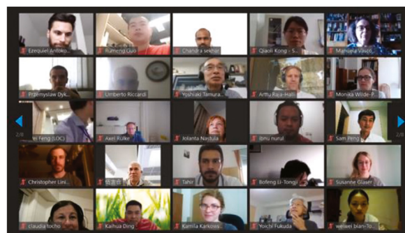
Fig. 1. a) The participants of the Symposium on site in front of the main building of APM, CAS, where the Symposium was held. b) Part of international participants of the Symposium online.