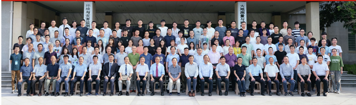
a) 第19届“地球动力学与固体潮”国际学术研讨会（中国武汉，2021年6月23日-26日） 19 th International Symposium on Geodynamics and Earth Tides (23-26 June 2021, Wuhan, China)

Based on the two co-located SG observations with 520 m depth difference, Kumar et al. (2022) [12] found that the gravity residuals