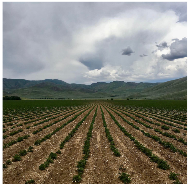
Fig. 2 Potato field in Blaine County, Idaho.