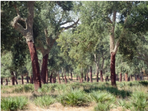
Illustration de la couverture : Forêt de la Maâmora, Maroc.