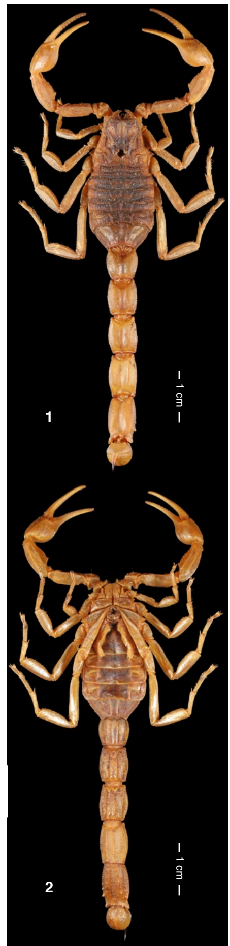
Fig. 1-2. Buthus maamora sp. n., ♀ holotype, habitus (dried specimen). 1. Dorsal aspect. 2. Ventral aspect.

Morphology . – Carapace moderately to strongly granular; anterior margin with a weak concavity. Carinae strongly marked; anterior median, central median and posterior median carinae strongly granular, with 'lyre' configuration. Furrows deep. Median ocular tubercle located in the centre of the carapace; eyes separated by about two ocular diameters; three pairs of lateral eyes of moderate size in relation to median eyes. Sternum triangular, weakly narrowed, slightly wider than long. Mesosoma: three longitudinal carinae moderately to strongly crenulate in all tergites; lateral carinae reduced in tergites I and II; tergite VII pentacarinata. Tergites I-VI moderately to strongly granular on lateral sides; the central area between lateral carinae minutely granular; tergite VII entirely minutely granular. Venter: genital operculum divided longitudinally, each plate with a semi-oval shape. Pectines: pectinal tooth count 25-26; middle basal lamella of the pectines not dilated. Sternites without granules, smooth with elongated spiracles; four moderate carinae on sternite VII; four weak carinae on VI; other sternites acarinated and with two vestigial furrows. Metasomal segments with a weak setation, 'oligotrichous' as defined by Vachon (1952); segment I with ten complete