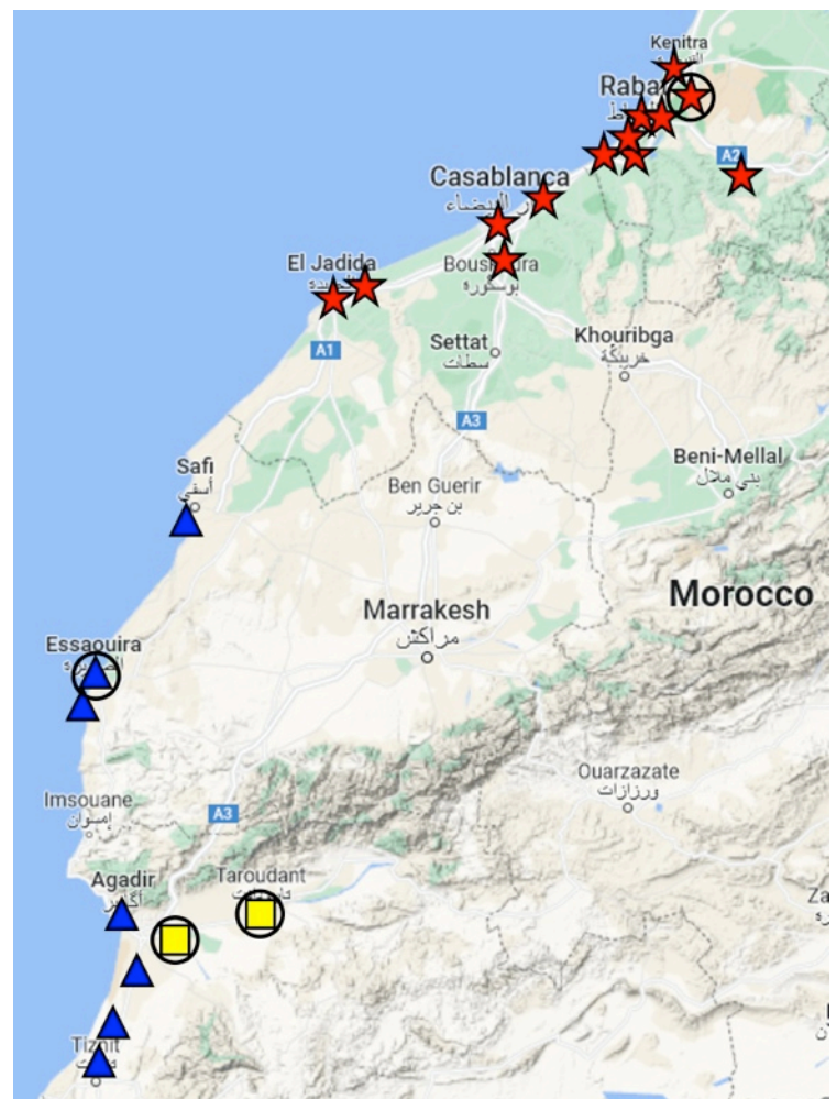
Fig. 7. Relief map of northeast Morocco showing the known distribution of the Buthus species discussed in this work: B. maamora sp. n. (red star), B. atlantis (blue triangle) and B. parroti (yellow square), with surrounded symbols showing the type localities.

Distribution and ecology. – B. maamora sp. n. is distributed along the Atlantic coast, from Kenitra to El Jadida (Vachon, 1952; El Hidan et al. , 2017; Sousa et al. , 2017). It does not seem to extend more in the South, where it is replaced by B. atlantis , from Safi (Fig. 7). The new species seems to inhabit both forest and sandy habitats, as specimens were found in coastal forests ( e.g. Maâmora, Temara, Daïf Erroumi) and sand beaches ( e.g. Mohammedia, El Jadida).