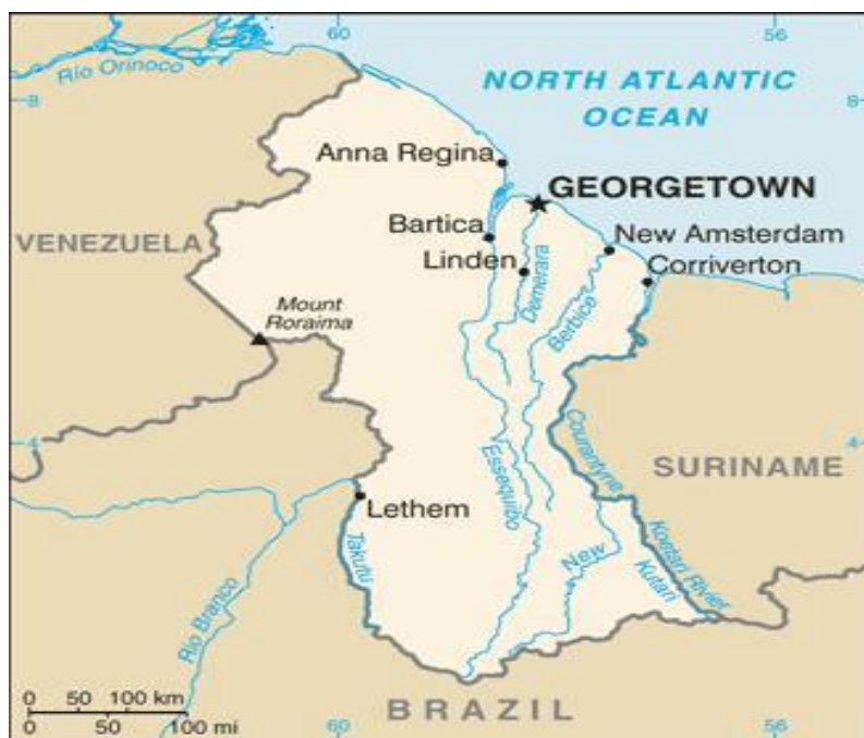
Figure 1. Location of Cooperative Republic of Guyana (CRG)

Like every other pre-colonial societies of Asia, Africa, and Latin America, Guyana has unique and complex historical foundations and several transformations from the pre-colonial to colonial and from the colonial to post-colonial albeit postmodern societies. The country known today as Cooperative Republic of Guyana (CRG) located at the northern corner of South America (see Figure 1) derived its name prior to European settlement from the name of the land “Guiana” which means the “Land of water” and that which in its present day reflects its British and Dutch colonial past, and is the only English speaking country of South America (Bonham, 2020). Ethnically, the country is presently a multiracial society with the people of India, Africa, Portuguese and Chinese descents. The Afro-Guyanese are said to account for 33% of the country’s population, while the Amerindian account for 8% and mixed of the white and other groups account for 11% of the total population of the country (Guyana Development Policy Review, 2003:1).