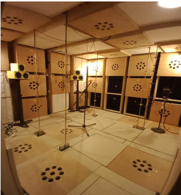
Figure 1. Picture of the room for broadcast of infrasonic frequencies. The room is equipped with 32 subwoofers speakers ( f \leq 40 Hz), 40 low frequency speakers ( 40 < f \leq 3000 Hz) and 6 medium frequency speakers ( 3000 < f \leq 17000 Hz).

To broadcast infrasonic frequencies the room is equipped with 32 subwoofer speakers on opposite walls (see Fig. 1) that allows to reach the needed levels to make these frequencies audible. The room is able to reach significant level while keeping distortions levels lower than their associated hearing thresholds as shown in Fig. 2. A more thorough description of the room is proposed by Pachebat et al [7] (in French).