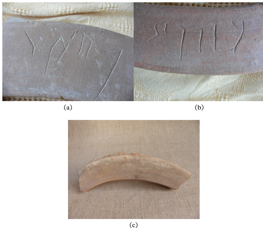
FIGURE 6. (a), (b) Aramaic inscriptions on pieces of wine jars from Uplistsikhe, photos made at the Uplistsikhe Fund of the Georgian National Museum. (c) Aramaic inscription on a fragment of a wine pitcher from Dedoplist Mindori, photo taken at the Dedoplist Mindori Fund of the National Mesum of Georgia.

linguistic interpretations and comments together with a bibliographic index; (2) theoretical studies: a systematic linguistic-paleographic examination of published as well as unpublished material; their comparative analysis with Aramaic script of Armenia and other types of contemporary Eastern Aramaic writings; revealing paleographic peculiarities and evolutionary regularities of the South Caucasian Aramaic script.