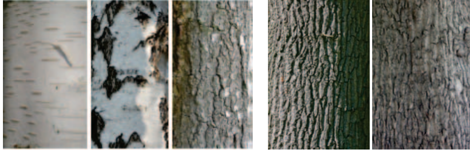
Figure 1. Examples of bark images from (left) the same species, (right) two different species.