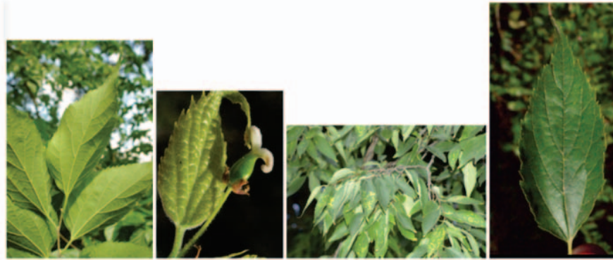
Figure 2. Examples of leaf images from InterFolia dataset: the 4 images are from the same species.