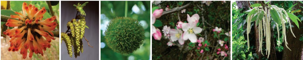
Figure 3. Examples of flower/fruit images from InterFolia dataset to show variability.