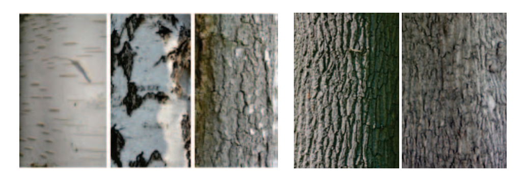
Figure 1. Examples of bark images from (left) the same species, (right) two different species.