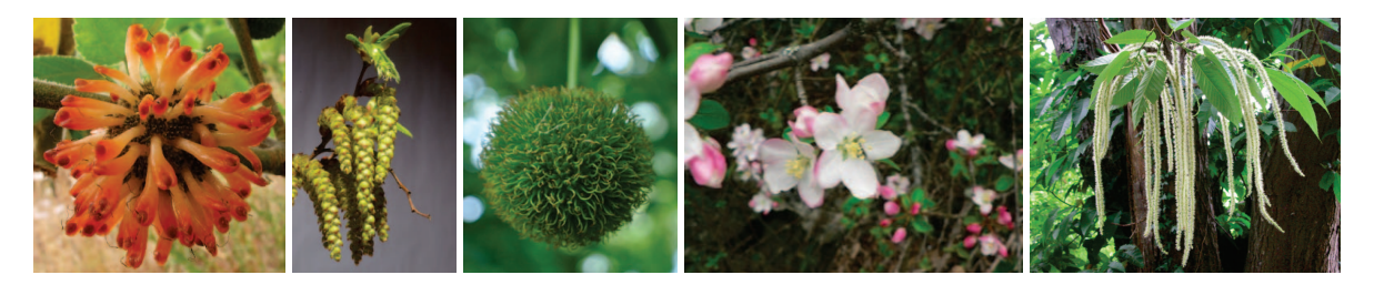
Figure 3. Examples of flower/fruit images from InterFolia dataset to show variability.