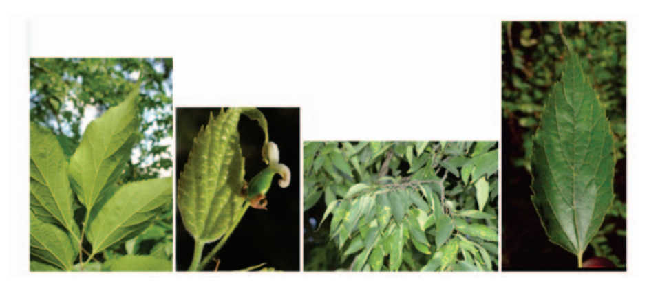
Figure 2. Examples of leaf images from InterFolia dataset: the 4 images are from the same species.