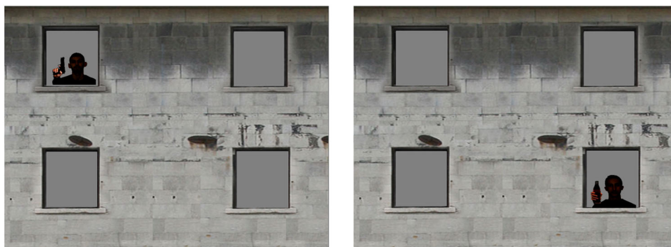
FIGURE 1 Example of an armed trial (left panel) and an unarmed trial (right panel) of the shooting decision task. [Color figure can be viewed at wileyonlinelibrary.com ]

Following completion of the Dark Tetrad questionnaire, participants were asked to play a computerized shooting decision task presented as a video game. The task consisted of 80 trials and was adapted from previous studies conducted by Correll et al. (2002) and Mange et al. (2012). Each trial presented an unrecognizable target in one of four random positions within a building window (see Figure 1). In 40 of the trials, the target held a gun, while in the other 40, the target held an innocuous object of similar size, such as a soft drink bottle. Participants were instructed to shoot criminals (targets holding a gun) and not to shoot innocent victims (targets holding an innocuous object) as quickly as possible. Participants responded by pressing the “M” key on the right side of the keyboard to shoot or the “X” key on the left side of the keyboard to not shoot the target. A warning (the letter X in red characters) appeared if participants were too slow or made an incorrect decision within the 170–850 ms time frame. The task began with six training trials randomly selected by a computer program. The number of incorrect decisions made by