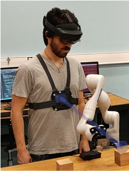
Figure 3: The user frame E_H (blue cube) and robot end-effector frame E_R are tracked using an Optitrack system. The Microsoft HoloLens V2 headset displays the virtual arm (blue), its virtual effector E_{AR} (blue octagon) and current robot arm effector configuration (orange cube), represented here. The robot effector is servoed to follow the virtual effector.

knowledge regarding the user's body part to which the virtual robotic arm should be attached.