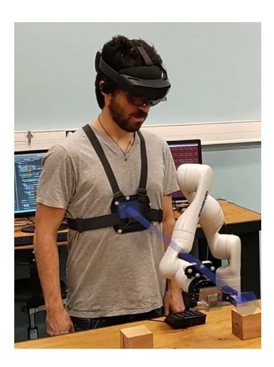
Figure 3: The user frame E_H (blue cube) and robot endeffector frame E_R are tracked using an Optitrack system. The Microsoft Hololens V2 headset displays the virtual arm (blue), its virtual effector E_{AR} (blue octagon) and current robot arm effector configuration (orange cube), represented here. The robot effector is servoed to follow the virtual effector.

knowledge regarding the user's body part to which the virtual robotic arm should be attached.