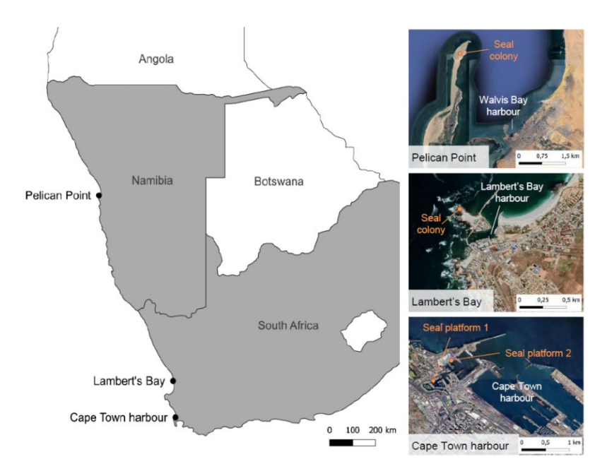
144 Figure1: Map of Southern Africa with locations of Lambert's Bay breeding colony and Cape Town harbour (left, Pelican Point breeding colony in which a similar study was conducted 145 recently (Martin et al., 2022) is indicated as well). Satellite view of the three study sites (right). 146