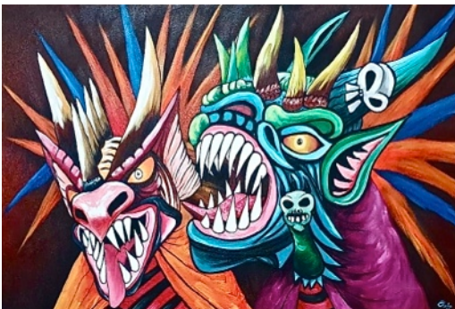
Illustration de la couverture :

Alfredo Lanuza-Garay & Marleny Rivera ..... 1 – 6