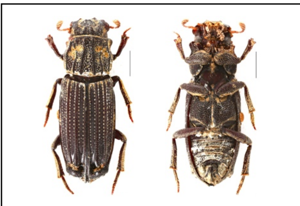
Illustration de la couverture :

Lukasz Minkina, Stanislav Jákl & Aleš Bezděk ..... 1 – 5