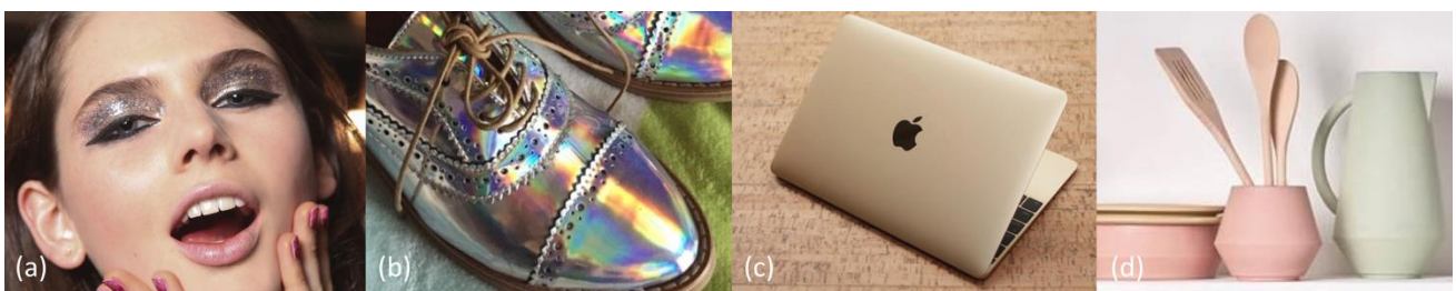
Figure 1. Sparkle (a), iridescence (b), brushed metal (c), matt (d). Visual effects follow that the societal needs and its evolution.

In the 2010s, perhaps it is the awareness of the human footprint on our planet that drives us to return to surfaces that appear more natural, more biological. Gloss, which was a symbol of luxury in the 20th century, becomes "bling-bling." We prefer