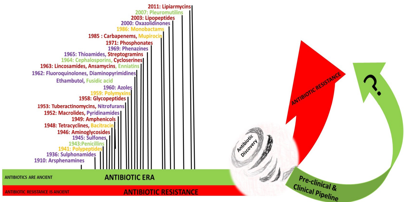
Figure 3. The chase and the race between antibiotics and antimicrobial resistance. The classes of antibiotics and dates of clinical introduction into the market are shown. Purple color: Synthetic antibiotics; gold color: antibiotics from other bacteria; green color: antibiotics from fungi; red color: antibiotics from actinomycetes [154].