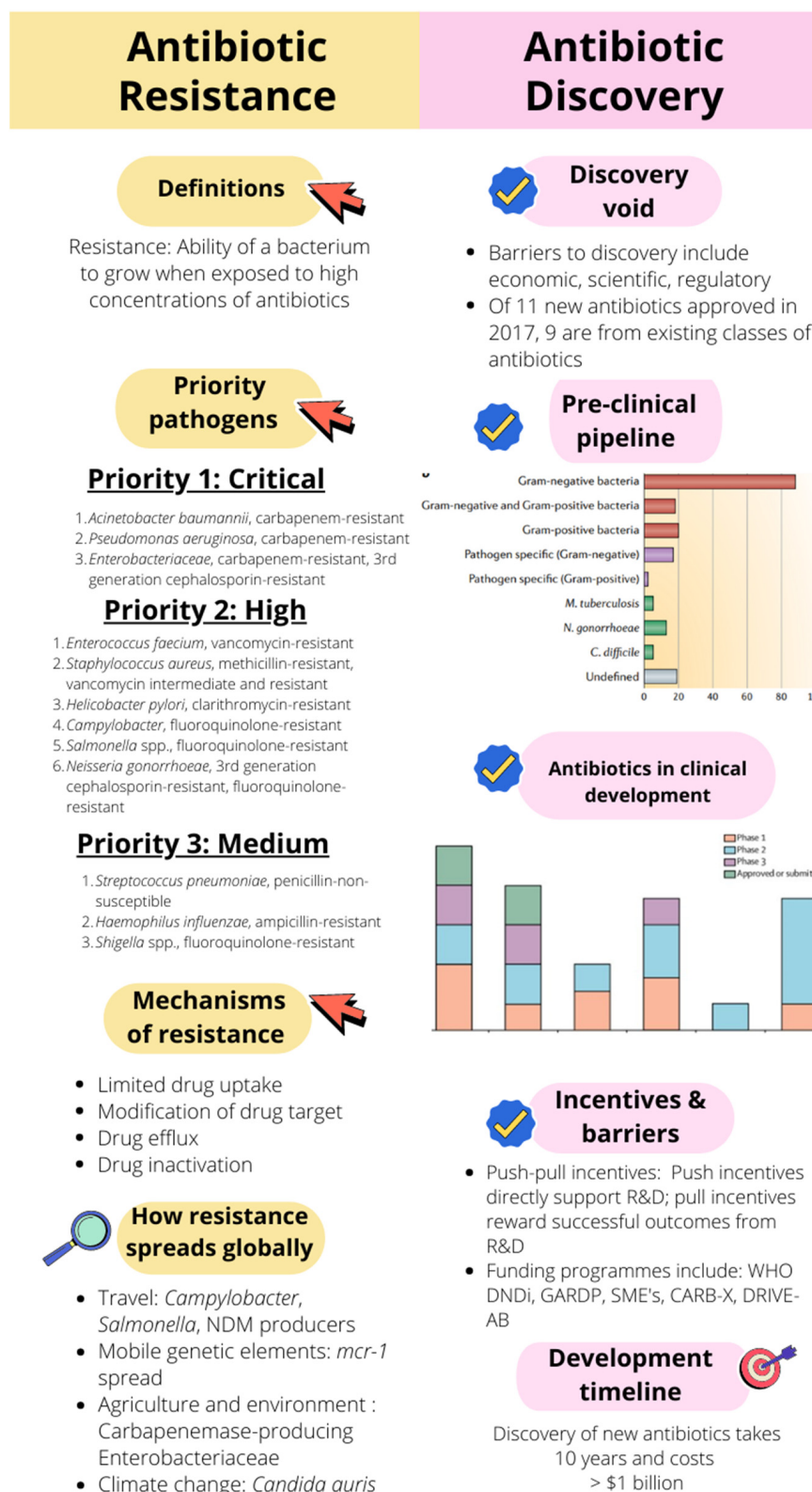
Figure 2. The basic concepts of antibiotic resistance (the chase) and antibiotic discovery (the race) discussed in this article. Pre-clinical pipeline graph: [13]. Antibiotics in clinical development: [14]. WHO DNDi: Health Organization Drugs for Neglected Diseases Initiative; GARDP: Global Antibiotic Research and Development Partnership; SMEs: Small and Medium-Sized Enterprises; CARB-X: Combating Antibiotic-Resistant Bacteria Biopharmaceutical Accelerator; DRIVE-AB: Driving reinvestment in research and development for antibiotics and advocating their responsible use.