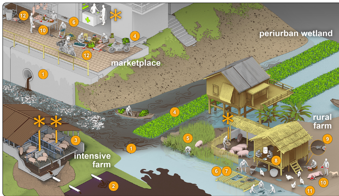
Figure 1. Unchecked environmental leaks and antibiotic use create myriad opportunities for the exchange of bacteria and mobile resistance elements among humans and animals. Potential transmission pathways include (1) inadequate sewage treatment infrastructure leads to contamination of human and animal drinking water; (2) animal waste contaminates drinking water; (3) raising many animals in confinement propagates disease; (4) raw sewage fertilizing crops for human consumption; (5) open defecation leads to fecal–oral transmission among humans and animals; (6) contact with animal waste; (7) farmed fish are fed pig and poultry feces; (8) consumption of undercooked chicken and fish; (9) pests contaminate food preparation areas; (10) meat contaminated by feces during processing; (11) multiple species in contact in unhygienic conditions; and (12) poor hygiene in markets. Layout stylized to indicate connectivity. Asterisks indicate antibiotic inputs.

among bacteria in both sectors. To our knowledge, leakiness as a potentiator of global antibiotic resistance has not been widely considered by the scientists and public health agencies who are driving policy and funding priorities in this field. Here, we provide evidence for the consequences of leakiness by describing the spread of mobile resistance elements between humans and animals in Phnom Penh, Cambodia, a highly leaky urban center in Southeast Asia.