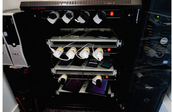
Fig. 2. Picture of the test bench with real devices

The probes are based on software-based sensors embedded in Android phones. Calibration work makes it possible to qualify the quality of the measurement. In fact, some information provided by the APIs or the manufacturer cannot be used. A quality score is given between 0 and 10. A score close to 10 indicates a high measurement frequency and precision. A score below 5 indicates that the measurement is not accurate enough to be used. So only phones with a score above 8 were included in the test. For iOS, since energy data is not provided by the platform, the solution is hardware-based, with a wattmeter placed between the battery and the iPhone.